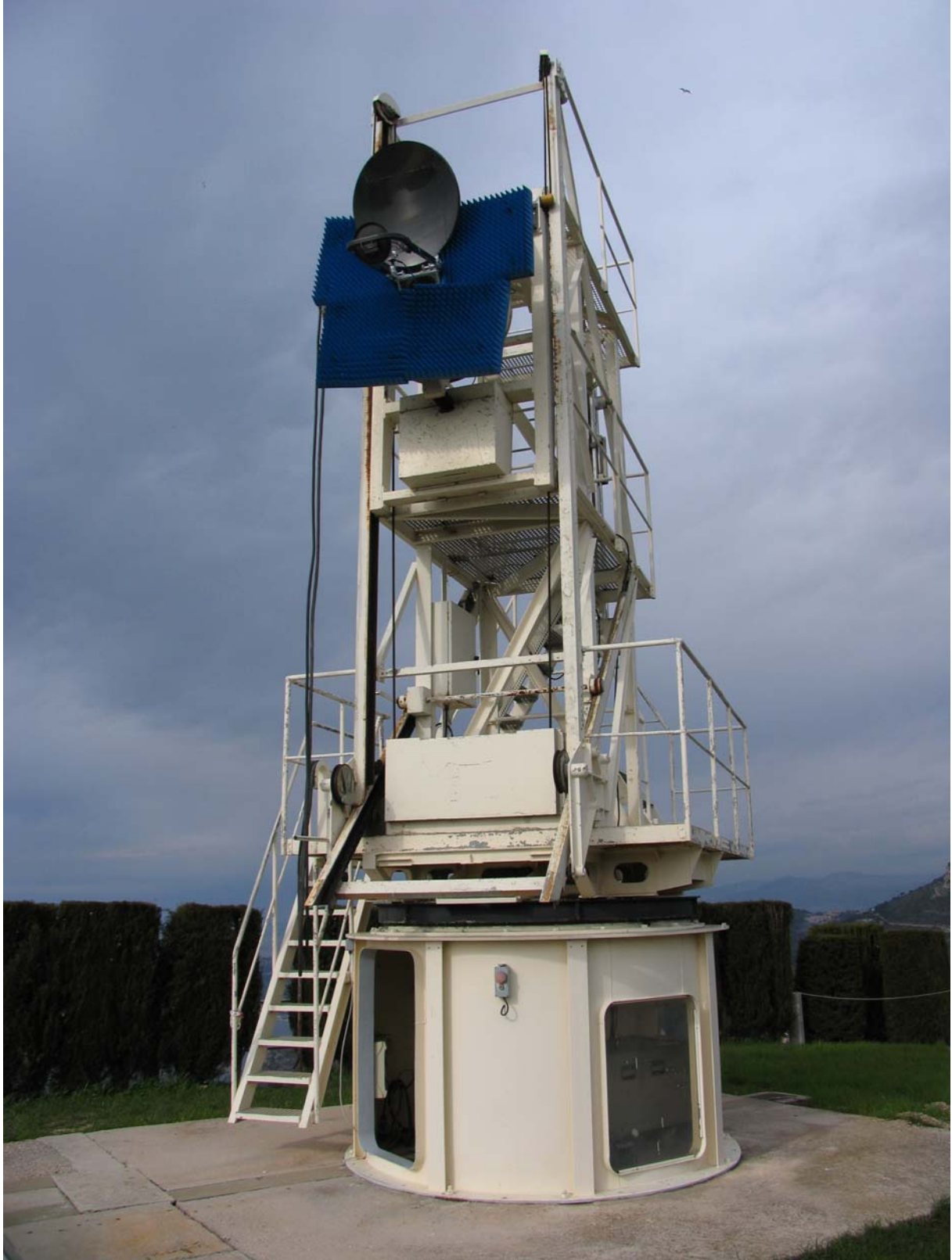
LightAway antenna on RF test bench (1/2)

Laboratory : France Telecom R&D, la Turbie – France