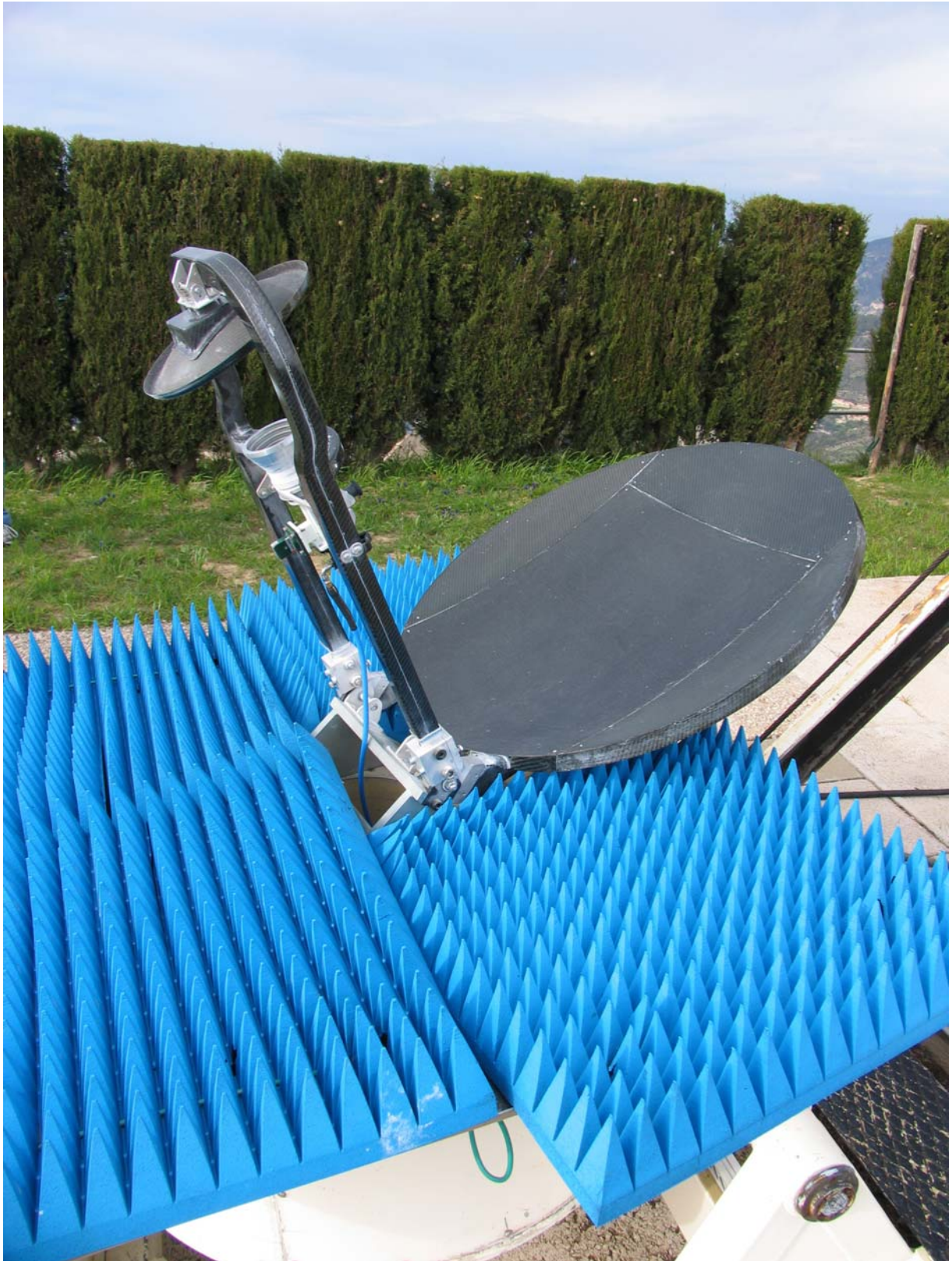
LightAway antenna on RF test bench (2/2)

Ref. : 080909-02-ed02_BRK_LightAway pattern and RF tests