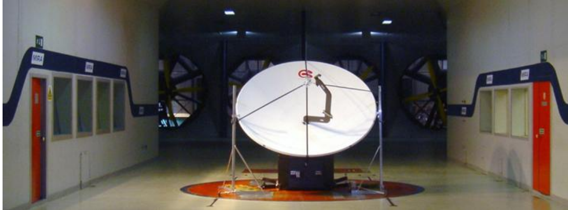
Fig. 3. Gigasat FA-240 off axis gain meets requirement for the following standards

Intelsat IESS-601 Eutelsat EESS-502 STANAG 4484 MIL-STD 188-164A