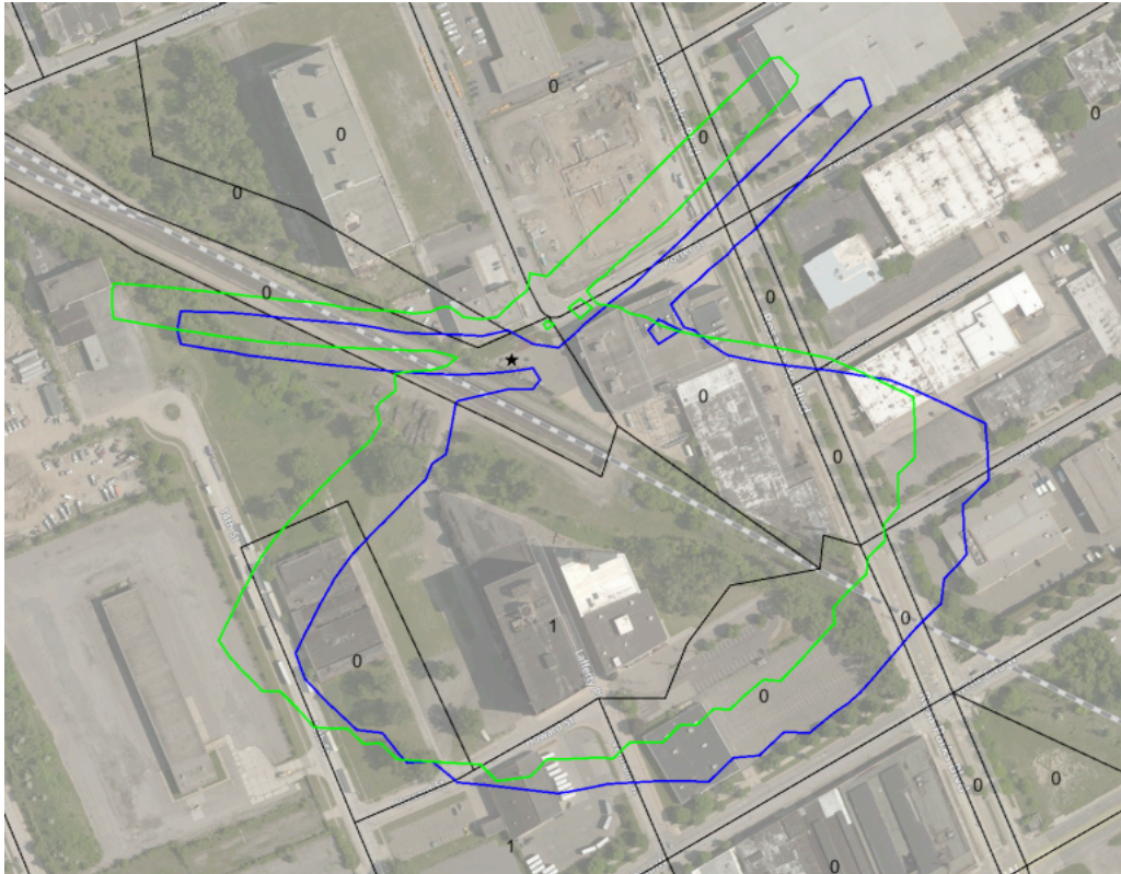
Figure 1 – Census block view of contour

However, even if the contour covered the entire geographic area of those census blocks, the total population of 2 is well below the 1,820 population limit. Thus, the actual population in the partial coverage of the contour is well within that limit. No further analysis of actual population covered is required.