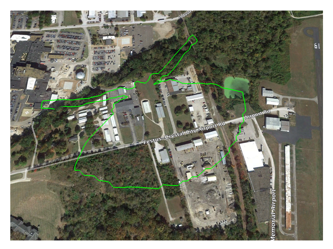
Figure 2 – St. Louis -77.6 dBm/(m<sup>2</sup> * MHz) PFD contour