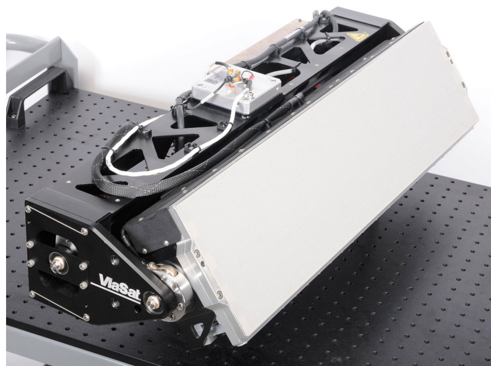
Figure 1 – Mantarry M32 Front View

The antenna used in this application is a low profile waveguide horn array. The Mantarry M32 is a mechanically steered waveguide horn array antenna. The M32 designation reflects the number of feed horns across the width of the aperture. The M32 shown in Figure 1 is 32 horns wide and provides a smaller radome footprint than the currently authorized M40 antenna. The height of the M32 array is 15.75 cm and the width is 63 cm.