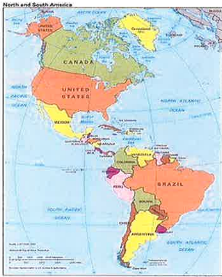
Figure 3. US channels and waterways, the Gulf of Mexico, Caribbean Sea, Atlantic Ocean, and Pacific Ocean

The geographic area where the ESVs will operate is in US channels and waterways, the Gulf of Mexico, Caribbean Sea, Atlantic Ocean, and Pacific Ocean.