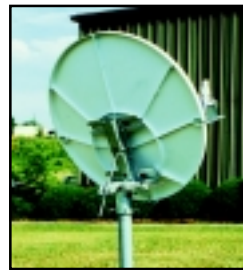
Back View .98 M Rx/Tx

Prodelin Corporation is the world's largest manufacturer of Rx/Tx VSAT antennas. We have the broadest product line in the industry including Receive Only, Rx/Tx and Rural Telephony antenna systems. Prodelin offers nineteen antenna sizes, 47cm to 4.5M. Prodelin is the leader in obtaining type certifications and approvals for Intelsat, AsiaSat and Eutelsat. Prodelin antennas provide the best quality in the market due to the sophisticated, precision SMC compression molding process technology. Prodelin provides the best value antenna solution to the market with competitive prices, the highest quality products and superb engineering support. Prodelin is ISO registered, KEMA # 70022.01. Prodelin - The Market Leader in VSAT Antennas.