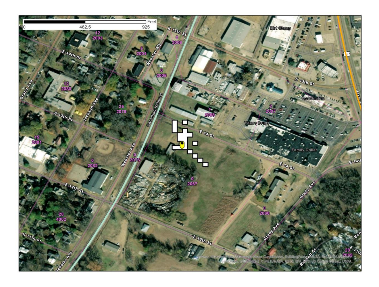
Figure 1 – Yazoo City, MS SAN -77.6 dB(mW/(m2 * MHz)) pfd contour

The population of Yazoo County is 28065, and thus the applicable population limit under Section 25.136(a)(4)(ii) is 450.