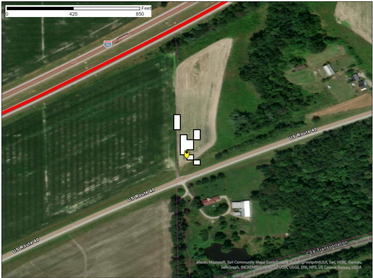
Figure 1 – Greenup, IL SAN -77.6 dB(mW/(m2 * MHz)) pfd contour

The population of Cumberland County is 11048, and thus the applicable population limit under Section 25.136(a)(4)(ii) is 450.