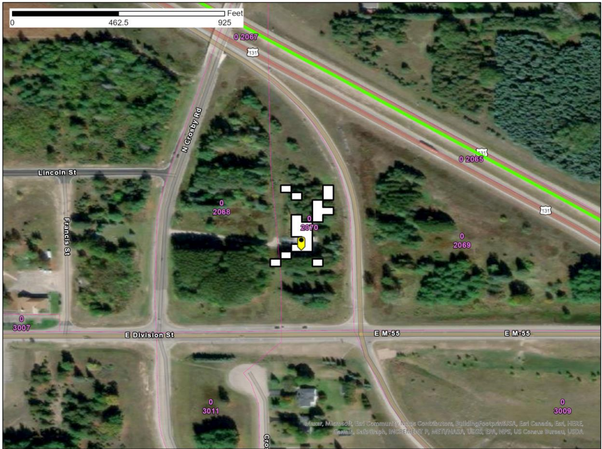
Figure 1 – Cadillac, MI SAN -77.6 dB(mW/(m2 * MHz)) pfd contour

The population of Wexford County is 32735, and thus the applicable population limit under Section 25.136(a)(4)(ii) is 450.