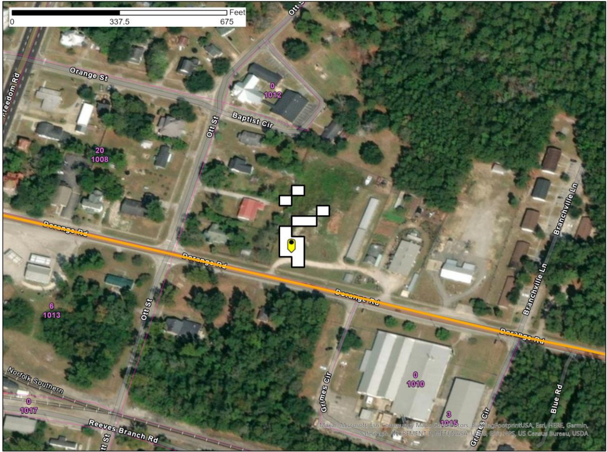
Figure 1 – Branchville, SC SAN -77.6 dB(mW/(m2 * MHz)) pfd contour

The population of Orangeburg County is 92501, and thus the applicable population limit under Section 25.136(a)(4)(ii) is 450.