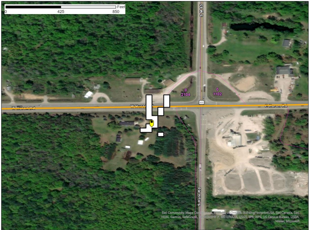
Figure 1 – OMER, MI SAN -77.6 dB(mW/(m2 * MHz)) pfd contour

The population of Arenac County is 15899, and thus the applicable population limit under Section 25.136(a)(4)(ii) is 450.