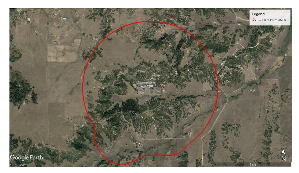
Figure 3. Case 1 PFD contour projected on an aerial image<sup>8</sup> of the proposed location.

The figures below demonstrate that the Castle Rock Gateway PFD contours do not contain any "Interstate, Other Freeways and Expressways, or Other Principal Arterial roads" as defined in functional classification guidelines issued by the Federal Highway Administration ("FHWA").7