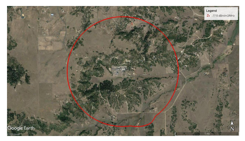
Figure 4. Case 2 projected PFD contour projected on an aerial image of the proposed location.

Based on maps from the FHWA's HEPGIS website,<sup>9</sup> there are also no major event venues, urban mass transit routes, passenger railroads, cruise ship ports, or roads classified by the FHWA's guidelines within either of the Castle Rock Gateway PFD contours.