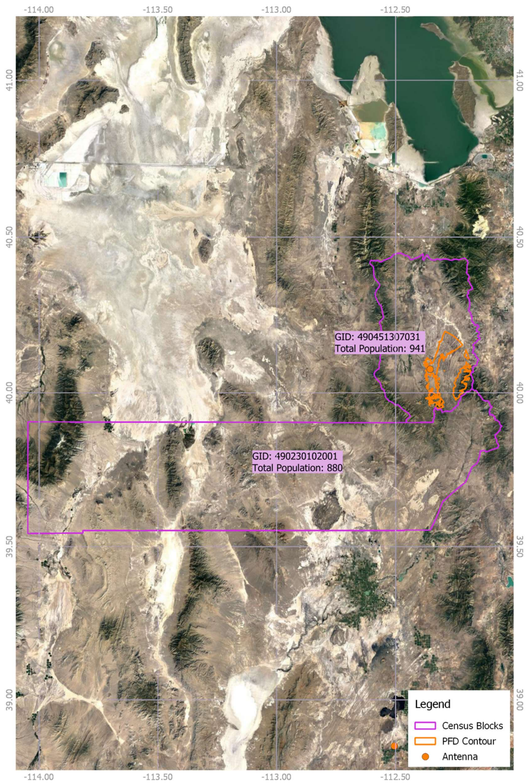
Figure 2. Wide Area View showing Census Block Boundaries