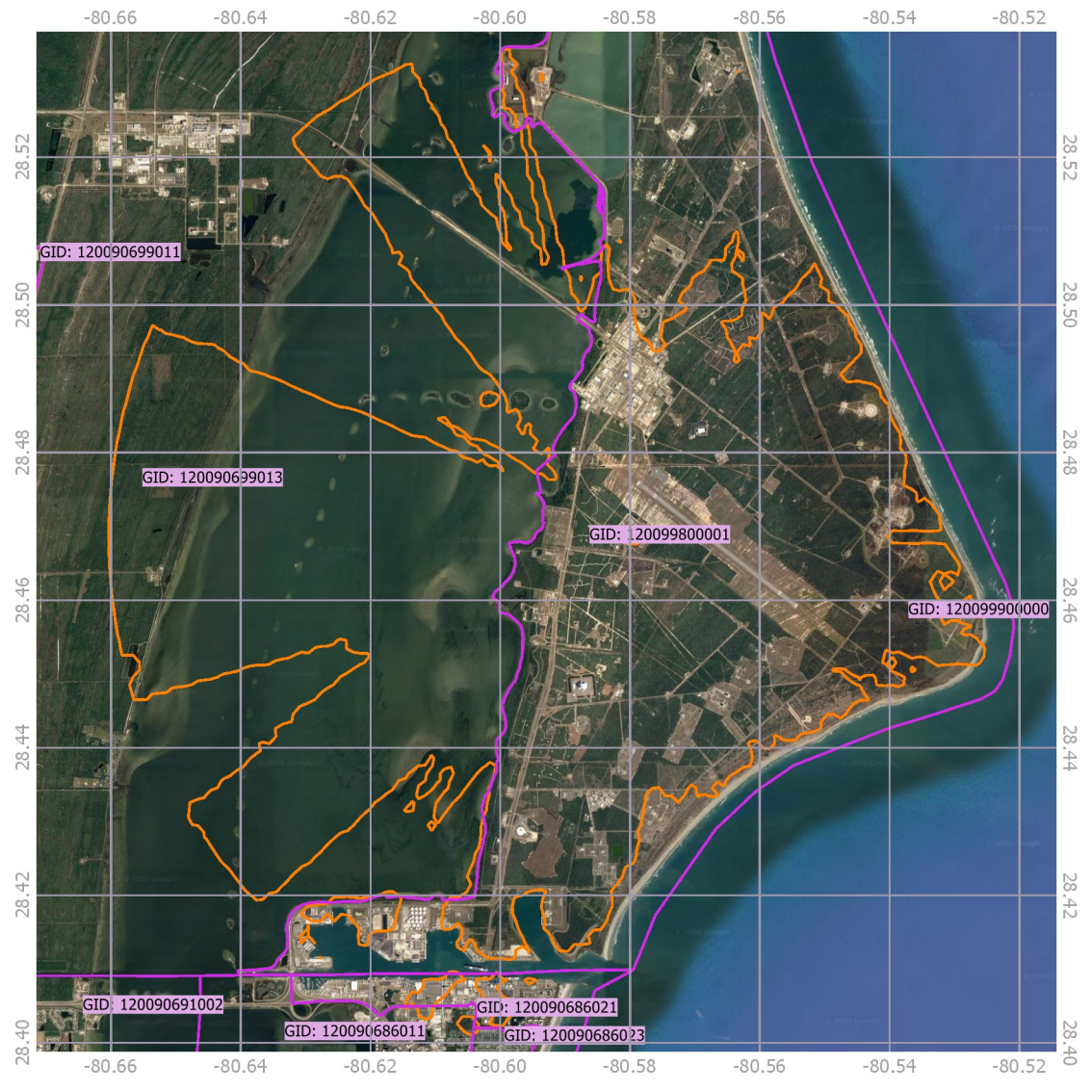
Figure 1. PFD Contours for Cape Canaveral Gateway

This PFD contour can also be used with other data sources to determine the population that falls within the contour. For this purpose, SpaceX used two sources for input data. First, it used the most recent version of NASA's Socioeconomic Data and Applications Center Gridded Population of the World ("GPWv4").<sup>20</sup> The GPWv4 data is based on population counts collected at the most detailed spatial resolution available from the results of the 2010 U.S.