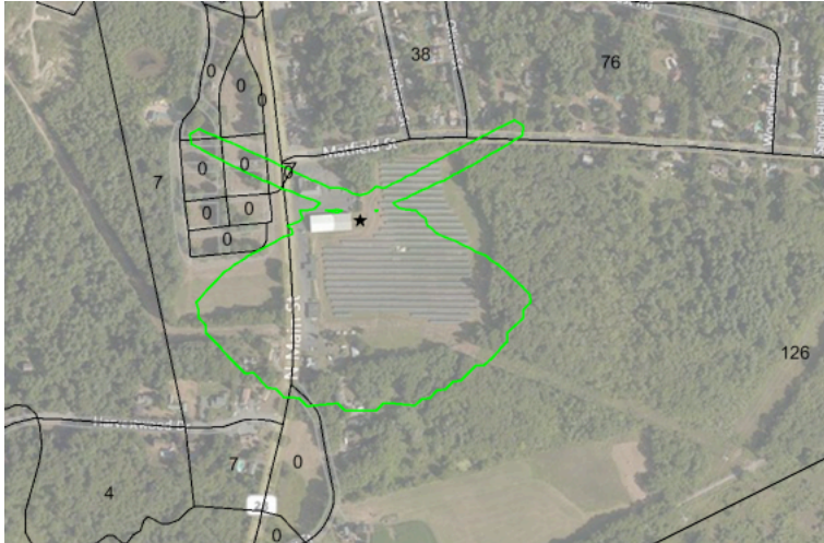
Figure 1 – Census block view of contour

those census blocks (which it clearly does not), the total population of 209 would be well below the 495 population limit. Thus, the actual population in the partial coverage of the contour is well within that limit. No further analysis of actual population covered is required.