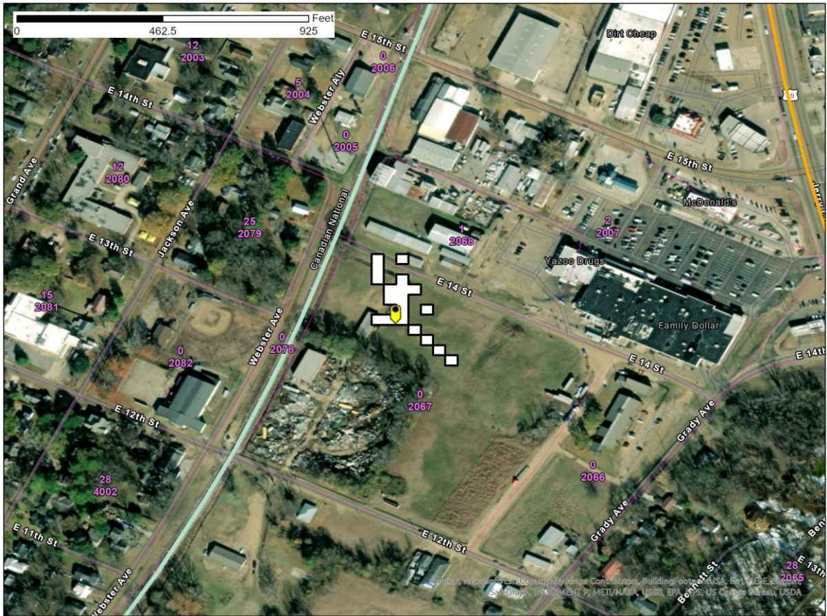
Figure 1 – Yazoo City, MS SAN -77.6 dB(mW/(m2 * MHz)) pfd contour

The population of Yazoo County is 28065, and thus the applicable population limit under Section 25.136(a)(4)(ii) is 450.