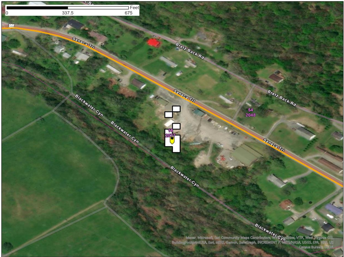
Figure 1 – Parsons, WV SAN -77.6 dB(mW/(m2 * MHz)) pfd contour

The population of Tucker County is 7141, and thus the applicable population limit under Section 25.136(a)(4)(ii) is 450.