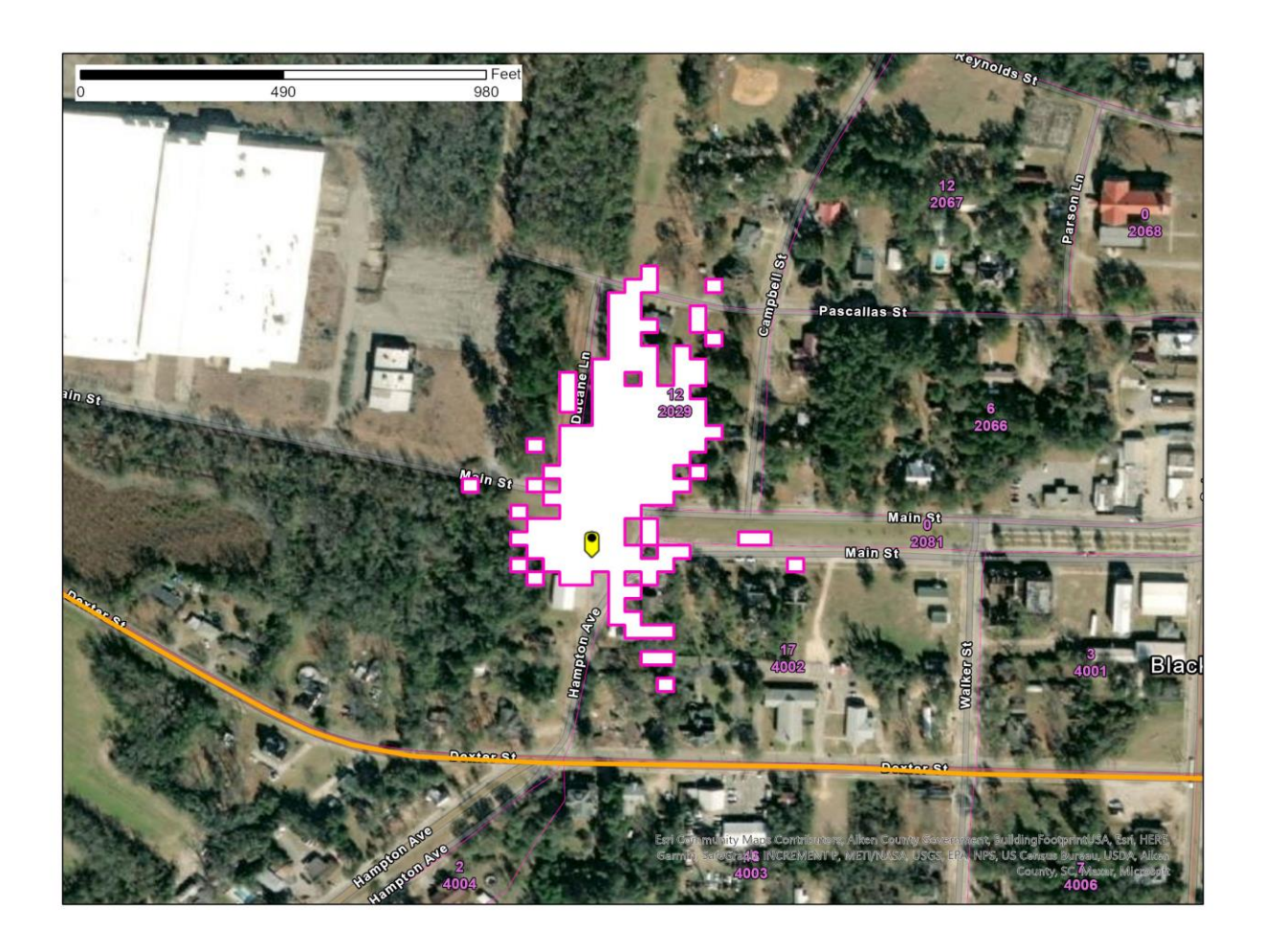
Figure 1 – Blackville, SC SAN -77.6 dB(mW/(m2 * MHz)) pfd contour

to the percentage of the geographic area of the census block covered by the contour.<sup>3</sup> Figure 1 below contains a diagram depicting the contour overlaid on a census block map.