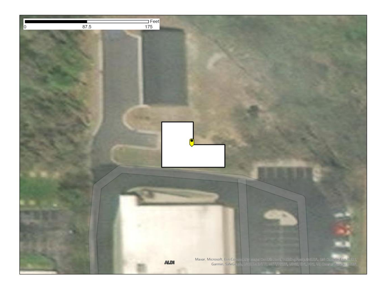
Figure 1 – Holland, MI SAN -77.6 dB(mW/(m2 * MHz)) pfd contour

The population of Ottawa County is 263801, and thus the applicable population limit under Section 25.136(a)(4)(ii) is 450.