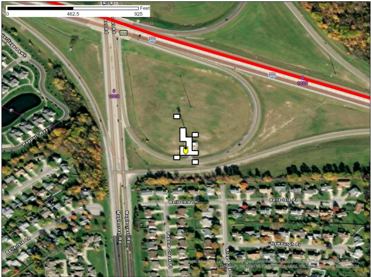
Figure 1 – St. Joseph, IN SAN -77.6 dB(mW/(m2 * MHz)) pfd contour

The population of Allen County is 355329, and thus the applicable population limit under Section 25.136(a)(4)(ii) is 450.