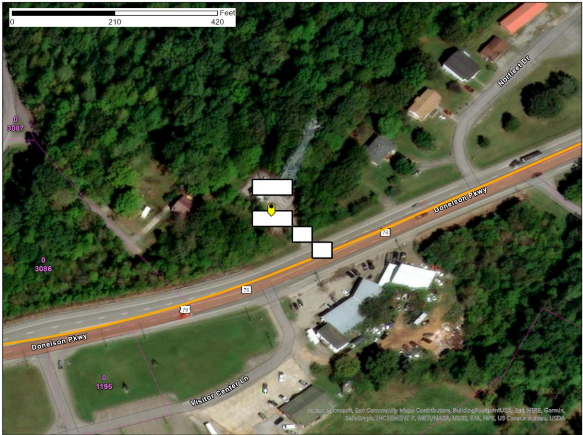
Figure 1 – Dover, TN SAN -77.6 dB(mW/(m2 * MHz)) pfd contour

The population of Stewart County is 13324, and thus the applicable population limit under Section 25.136(a)(4)(ii) is 450.