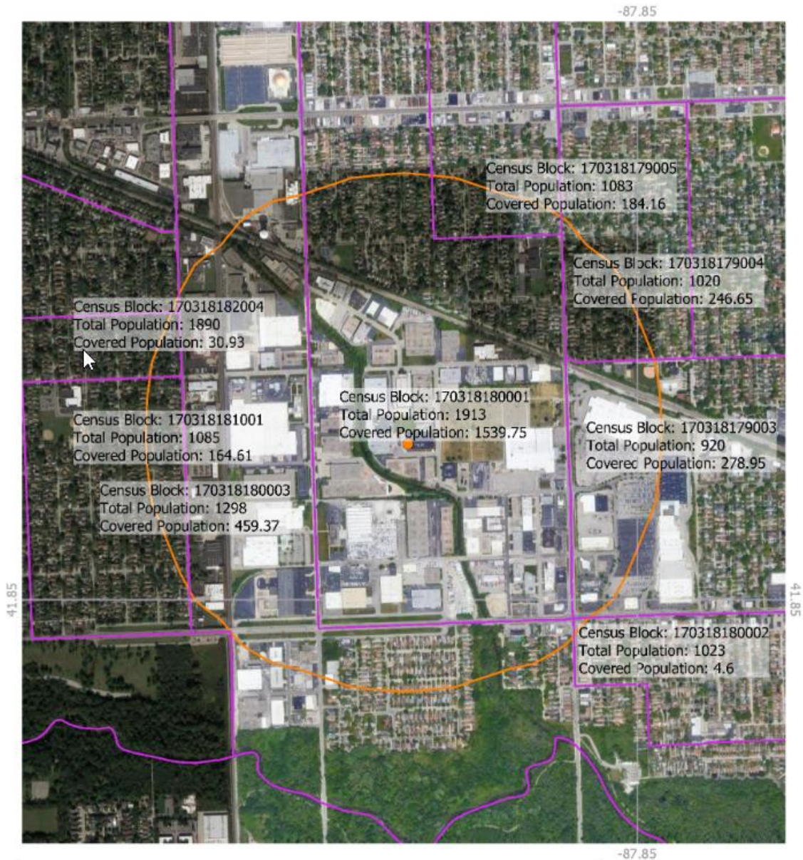
Figure 1. PFD Contours for Broadview Gateway