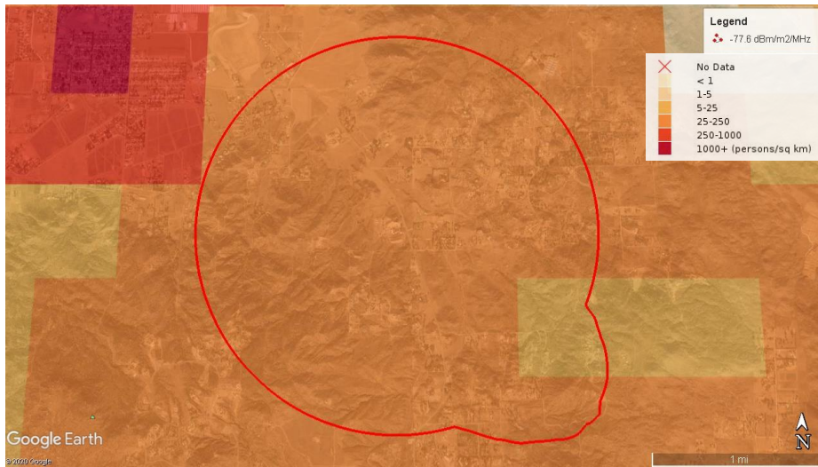
Figure 2. Case 2 PFD contour projected on to GPWv4 population grid.