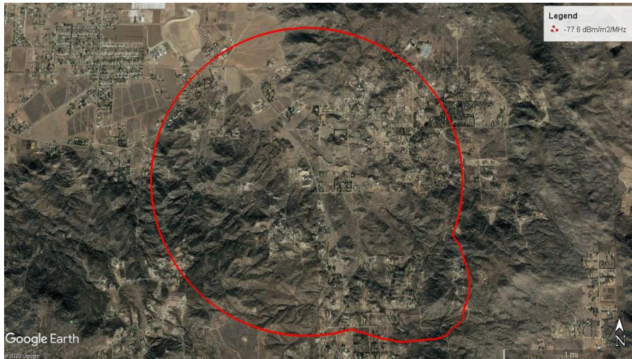
Figure 4. Case 2 projected PFD contour projected on an aerial image of the proposed location.

Based on maps from the FHWA’s HEPGIS website, 9 there are also no major event venues, urban mass transit routes, passenger railroads, cruise ship ports, or roads classified by the FHWA’s guidelines within either of the Riverside Gateway PFD contours.