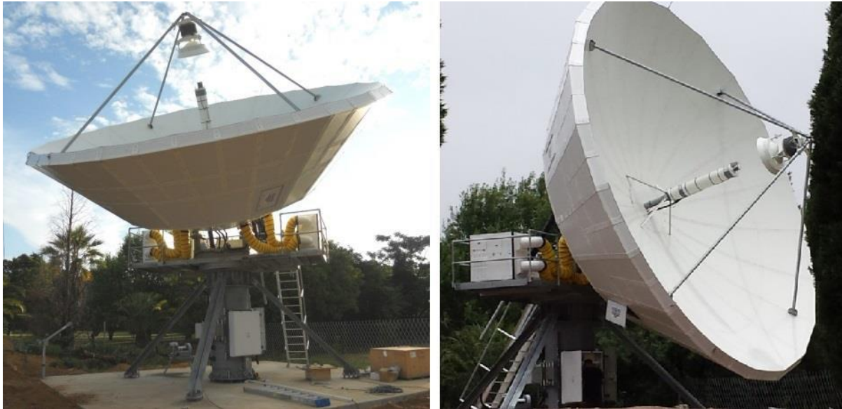
Figure 1-1: 9.4m Monopulse Antenna – Typical Installation

The following document presents additional Antenna Gain related information for the 9.4m Ka-Band antenna.