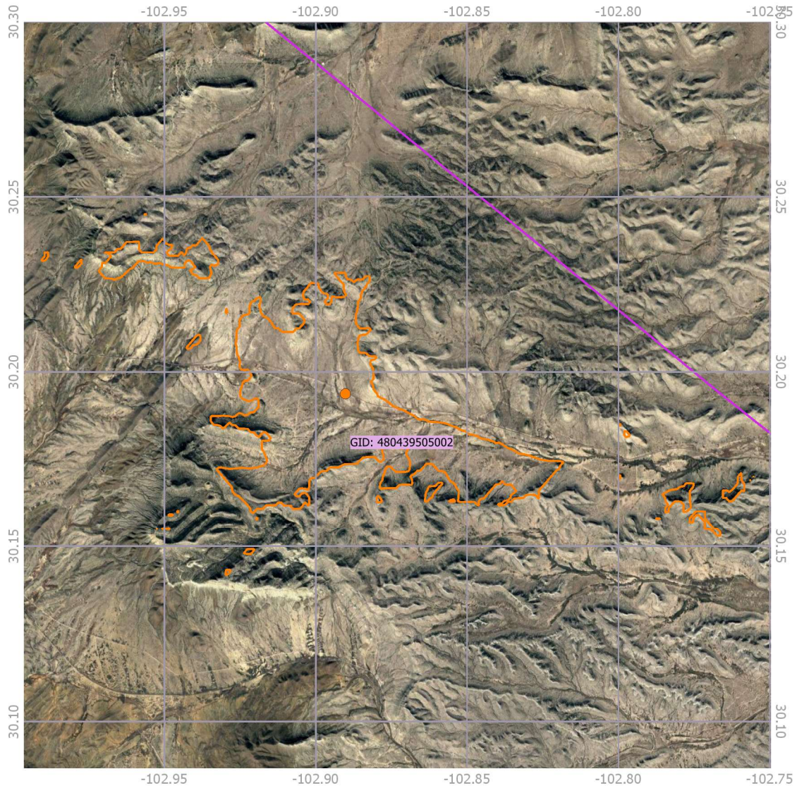
Figure 1. PFD Contours for Sanderson Gateway

This PFD contour can also be used with other data sources to determine the population that falls within the contour. For this purpose, SpaceX used two sources for input data. First, it used the most recent version of NASA’s Socioeconomic Data and Applications Center Gridded Population of the World (“GPWv4”). 19 The GPWv4 data is based on population counts collected at the most detailed spatial resolution available from the results of the 2010 U.S. Census, which is