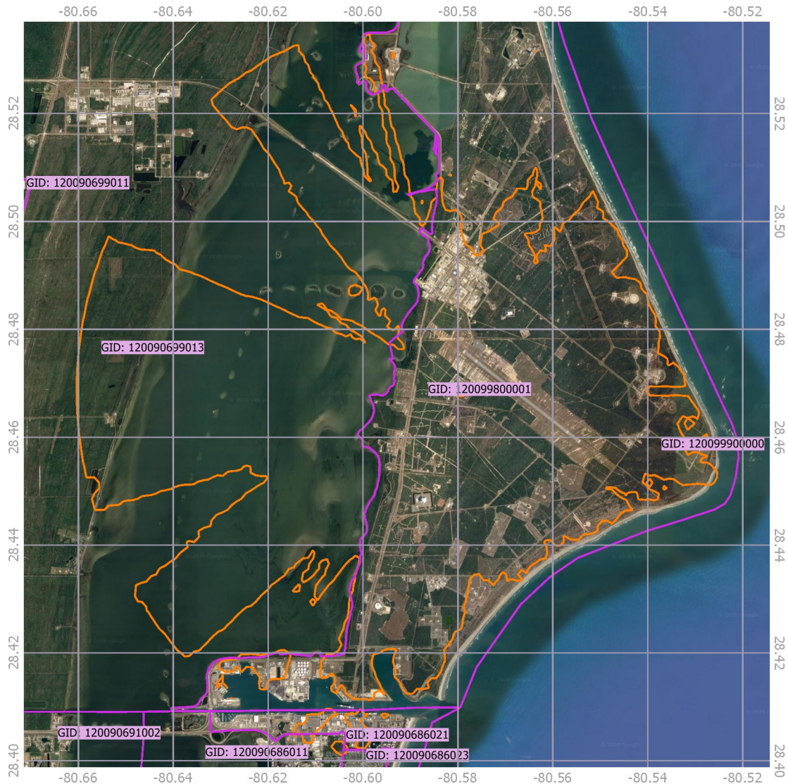
Figure 1. PFD Contours for Cape Canaveral Gateway

This PFD contour can also be used with other data sources to determine the population that falls within the contour. For this purpose, SpaceX used two sources for input data. First, it used the most recent version of NASA’s Socioeconomic Data and Applications Center Gridded Population of the World (“GPWv4”). 20 The GPWv4 data is based on population counts collected at the most detailed spatial resolution available from the results of the 2010 U.S.