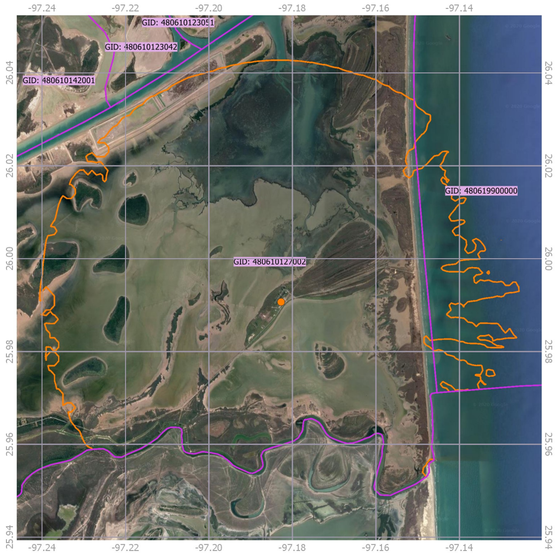
Figure 1. PFD Contours for Boca Chica Gateway

This PFD contour can also be used with other data sources to determine the population that falls within the contour. For this purpose, SpaceX used two sources for input data. First, it used the most recent version of NASA’s Socioeconomic Data and Applications Center Gridded Population of the World (“GPWv4”). 20 The GPWv4 data is based on population counts collected at the most detailed spatial resolution available from the results of the 2010 U.S.