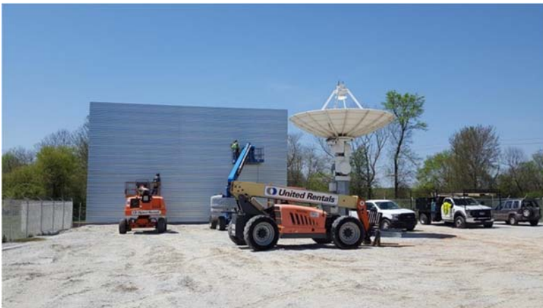
Antenna Side of Wall

A metallic RF shielding wall was constructed between Viasat’s 5.4 meter antenna and Flowery Branch broadcast tower as shown in Figure 1 and Figure 2. The wall has dimensions of 9.1 meters high by 15.2 meters wide and was built in accordance to local construction regulations.