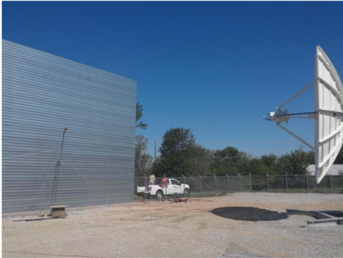
Measurement at Antenna Side of Wall