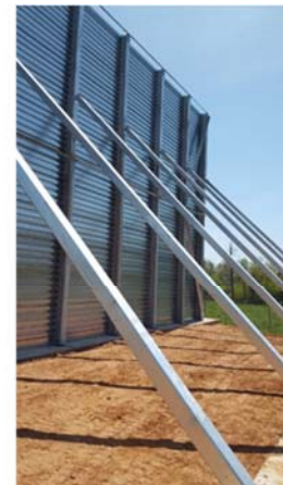
Rear of Wall