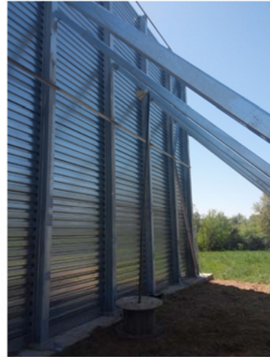
Measurement at Rear of Wall