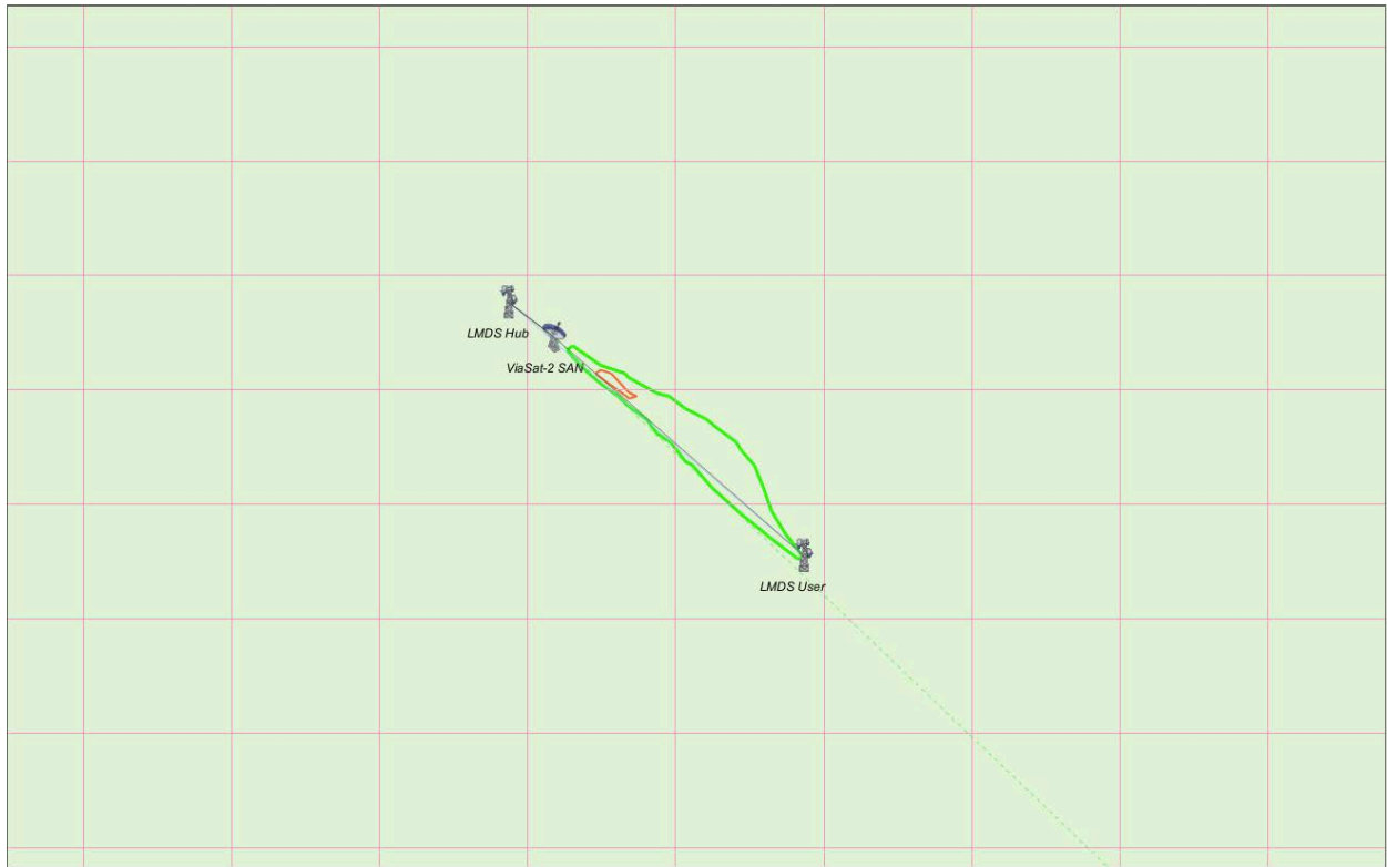
Figure 2 Visualyse Results for Static Hub Location