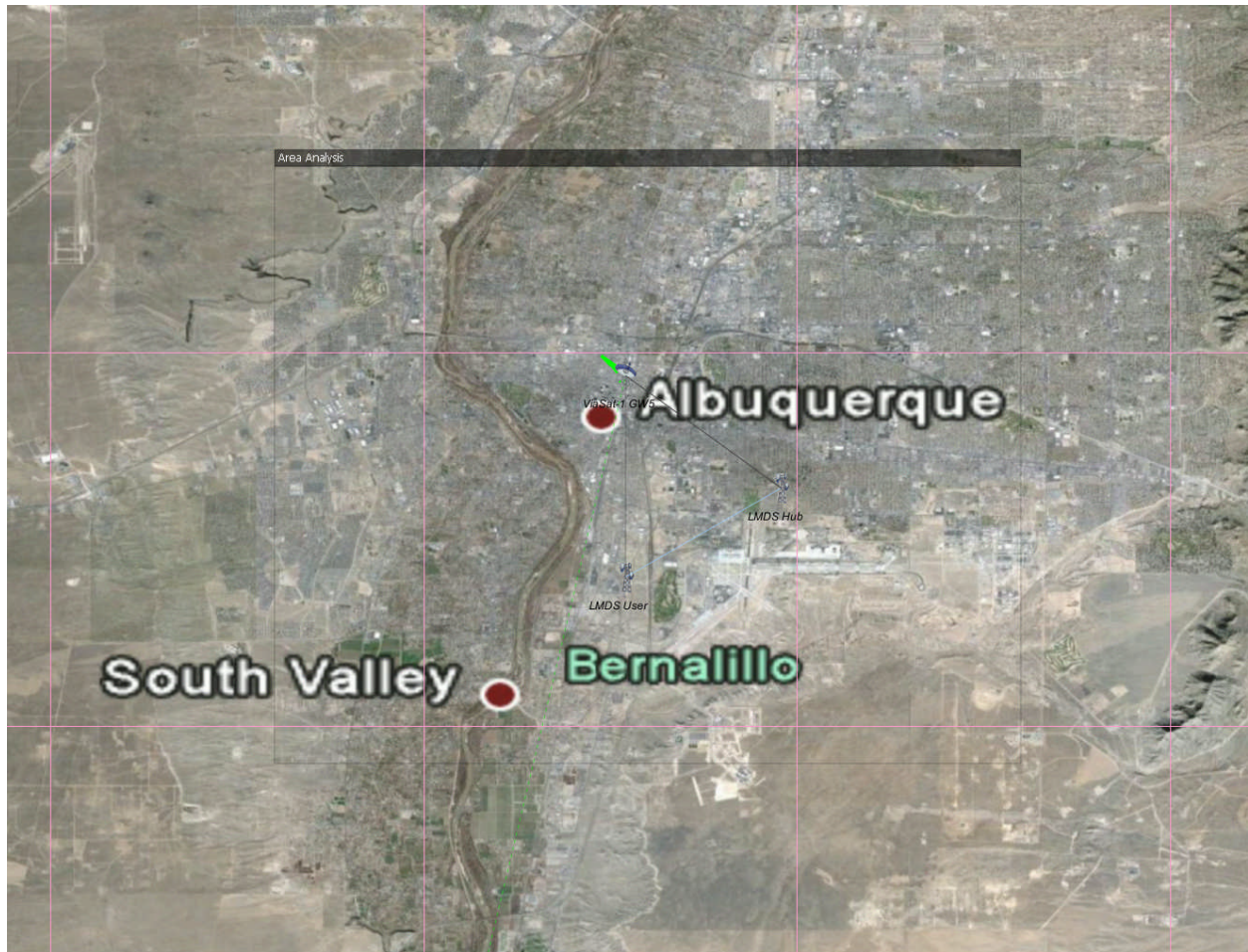
Figure 4 Visualise Scenario 2c

In figure 4, Visualise scenario 2c, the LMDS hub is located 5 km south east of the ViaSat gateway. In this case, the area where the 6% \Delta T/T threshold is exceeded is virtually nonexistent.