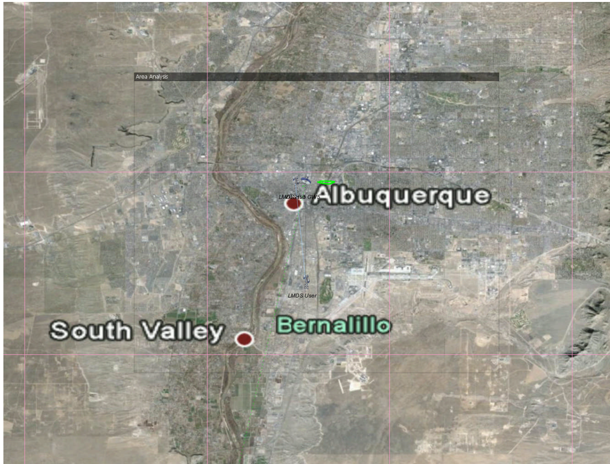
Figure 2 Visualise Scenario 2a

Figure 2 depicts Visualise scenario 2a, where the LMDS hub is 0.5 km due West of the ViaSat gateway. In this scenario, the worst case required separation is 1.4 km, but the affected area where the 6% \Delta T/T threshold is exceeded is reduced considerably from Scenario 1 to a narrow sliver to the east of the gateway earth station.