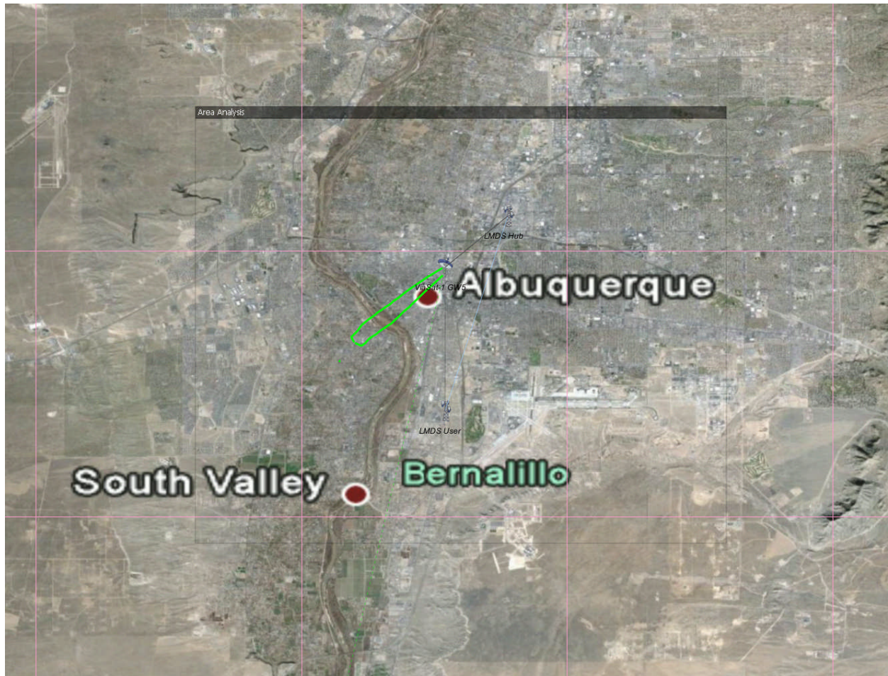
Figure 5 Visualise Scenario 2d

In figure 5, Visualise scenario 2d, the LMDS hub is located 3 km northeast of the ViaSat gateway. In this case, the area where the 6% \Delta T/T threshold is exceeded consists of a narrow sliver extending to the southwest for 4.5 km.