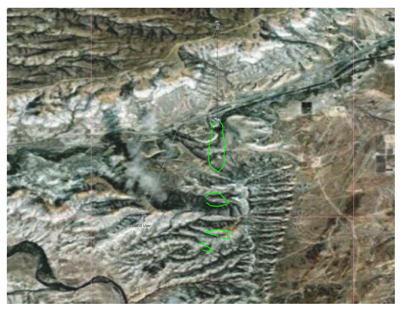
Figure 3 Visualise Scenario 2b

In figure 3, Visualise scenario 2b, the LMDS hub is located 4 km north of the ViaSat gateway and the area where the 6\% \Delta T/T threshold is exceeded is constrained to a narrow corridor that extends 5.5 km south of the ViaSat gateway.