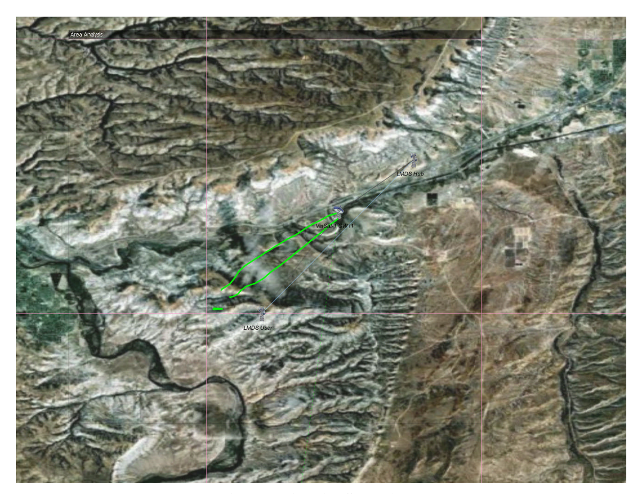
Figure 5 Visualise Scenario 2d

In figure 5, Visualise scenario 2d, the LMDS hub is located 3 km northeast of the ViaSat gateway. In this case, the area where the 6% \Delta T/T threshold is exceeded consists of a narrow sliver extending to the southwest for 5.4 km.