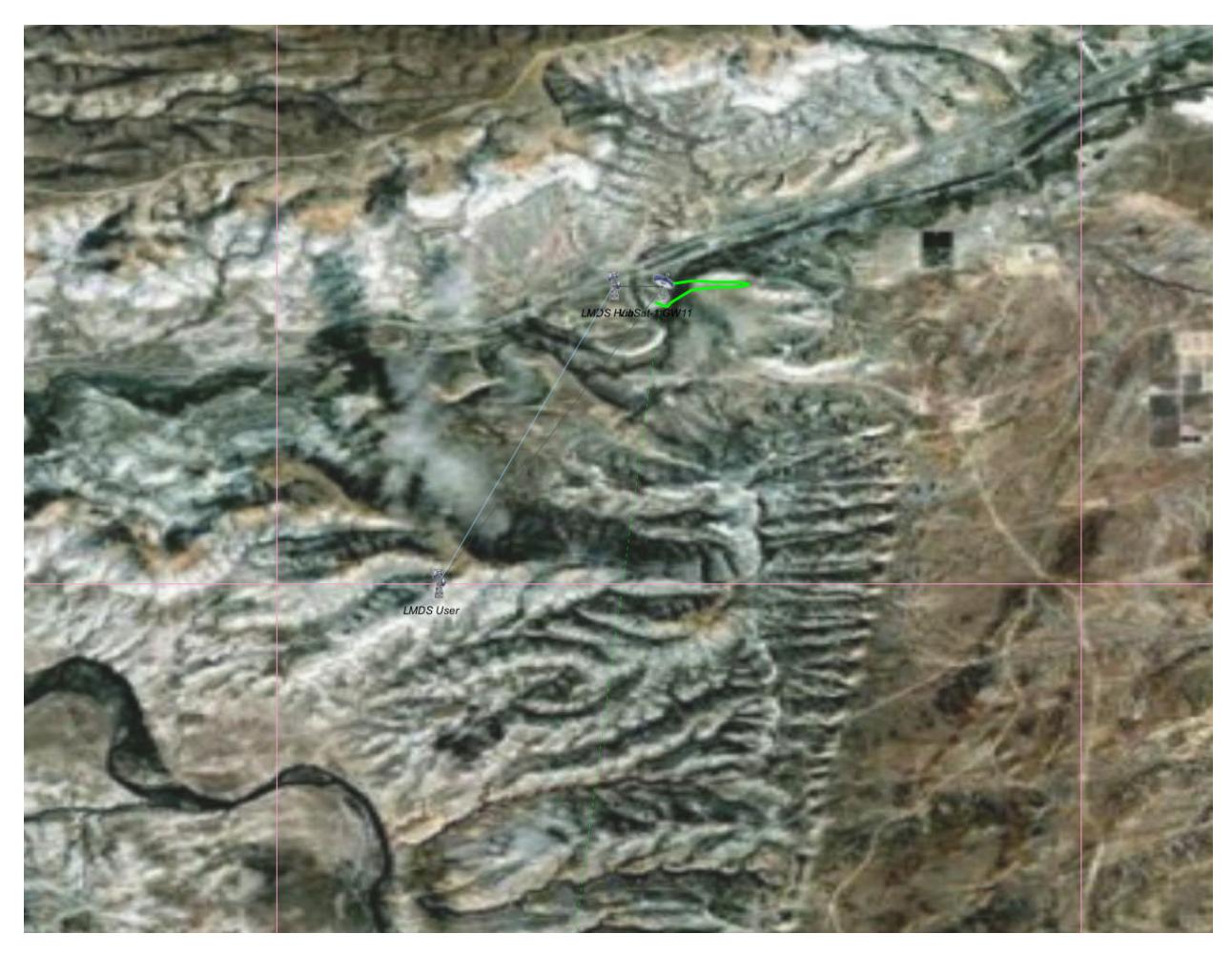
Figure 2 Visualise Scenario 2a

Figure 2 depicts Visualise scenario 2a, where the LMDS hub is 0.5 km due West of the ViaSat gateway. In this scenario, the worst case required separation is 0.9 km, but the affected area where the 6% \Delta T/T threshold is exceeded is reduced considerably from Scenario 1 to a narrow sliver to the east of the gateway earth station.