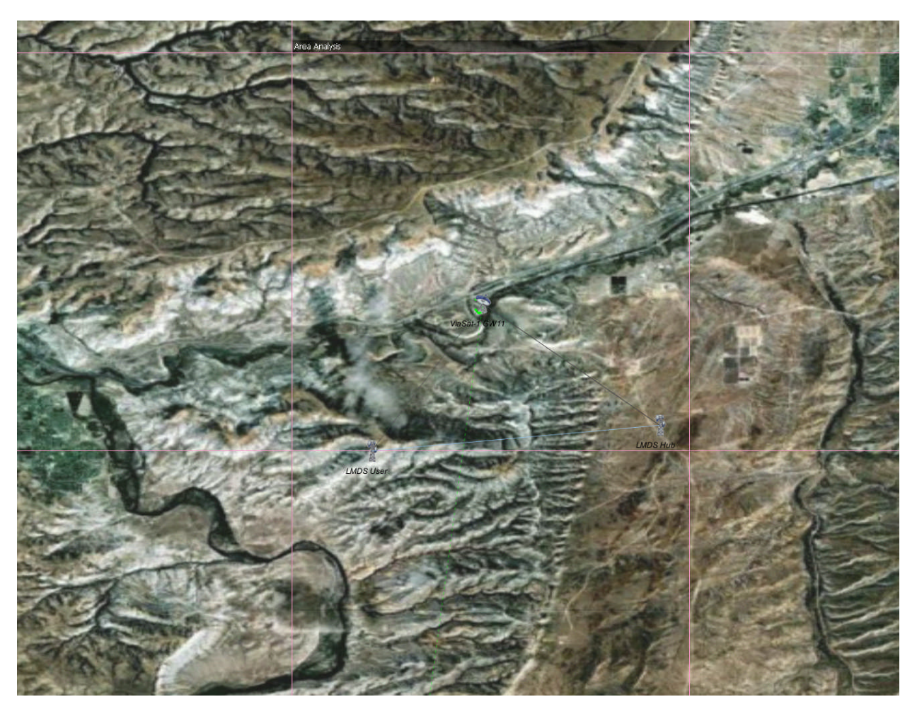
Figure 4 Visualise Scenario 2c

In figure 4, Visualise scenario 2c, the LMDS hub is located 5 km south east of the ViaSat gateway. In this case, the area where the 6% \Delta T/T threshold is exceeded is virtually nonexistent.