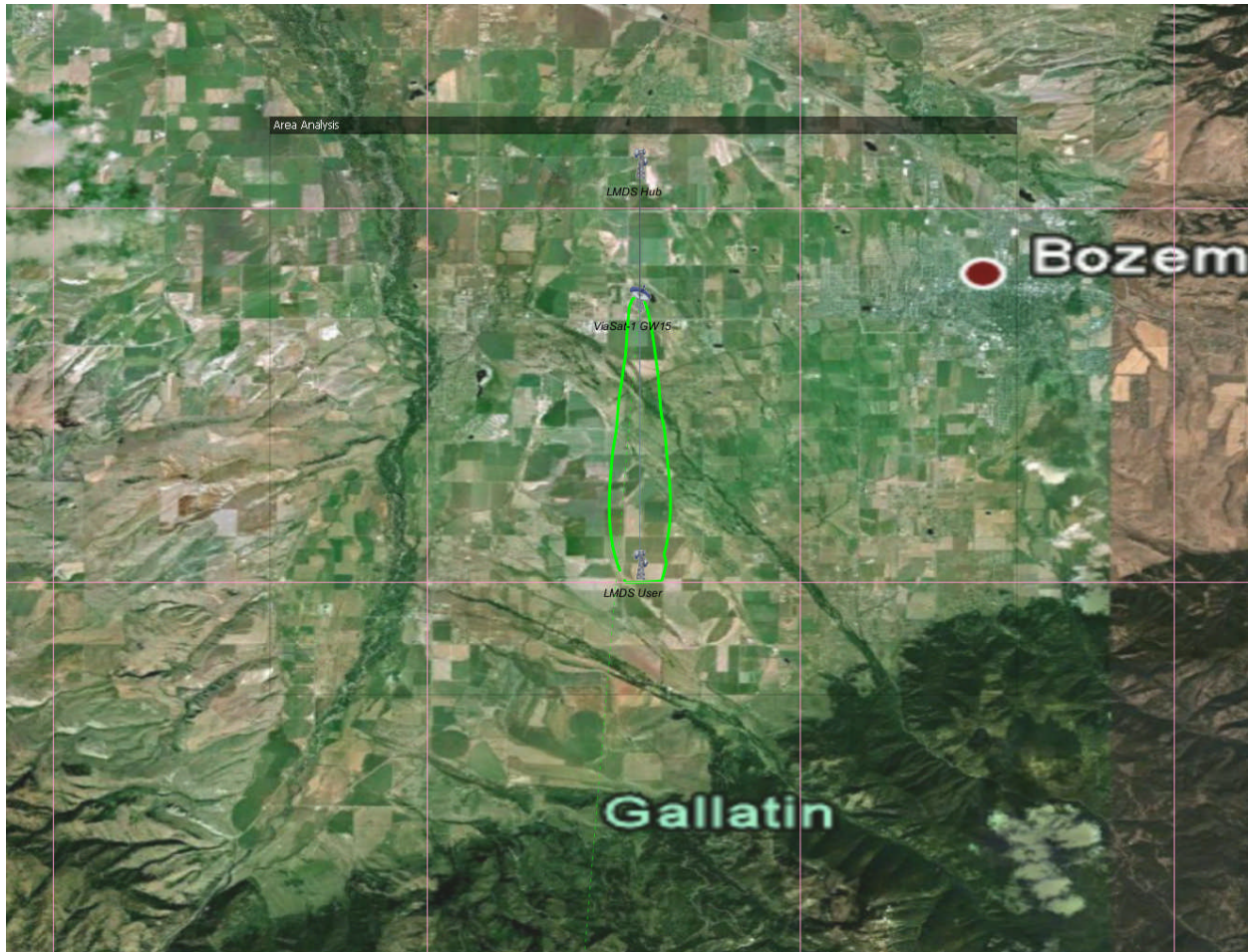
Figure 3 Visualise Scenario 2b

In figure 3, Visualise scenario 2b, the LMDS hub is located 4 km north of the ViaSat gateway and the area where the 6% \Delta T/T threshold is exceeded is constrained to a narrow corridor that extends 8.3 km south of the ViaSat gateway.