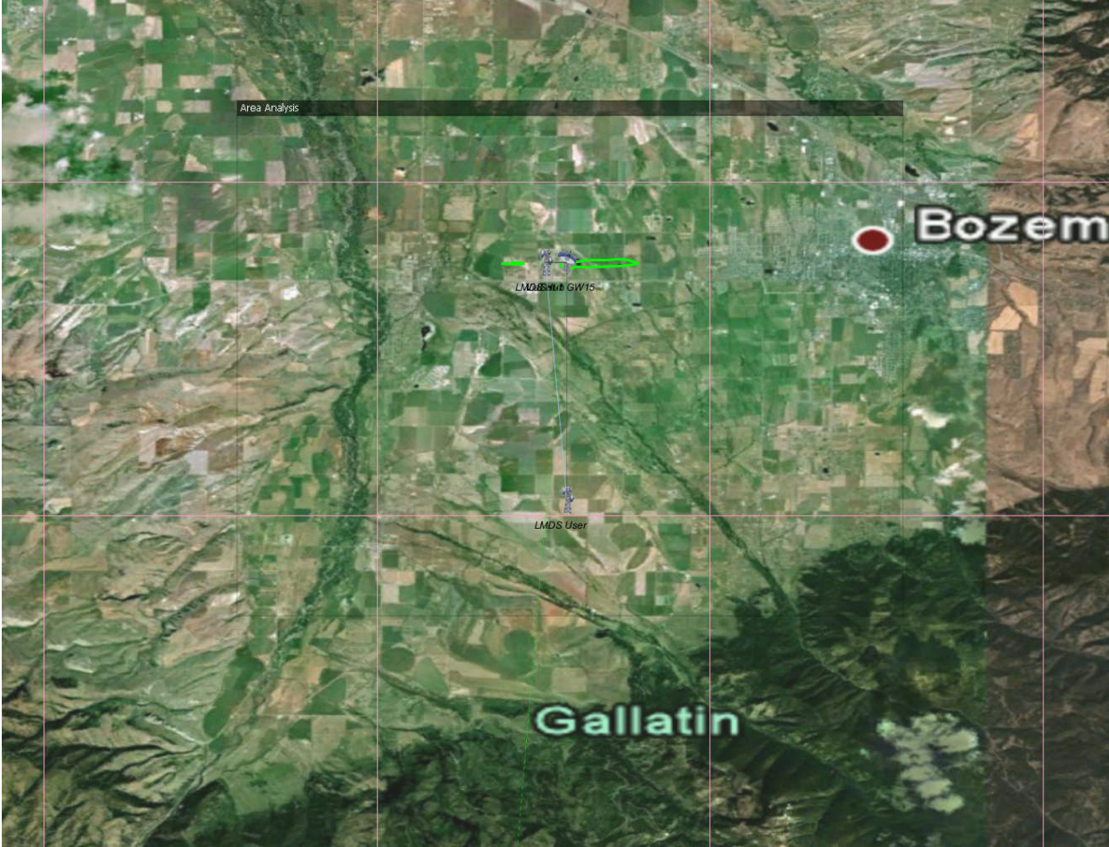
Figure 2 Visualise Scenario 2a

Figure 2 depicts Visualise scenario 2a, where the LMDS hub is 0.5 km due West of the ViaSat gateway. In this scenario, the worst case required separation is 1.6 km, but the affected area where the 6% \Delta T/T threshold is exceeded is reduced considerably from Scenario 1 to a narrow sliver to the east of the gateway earth station.