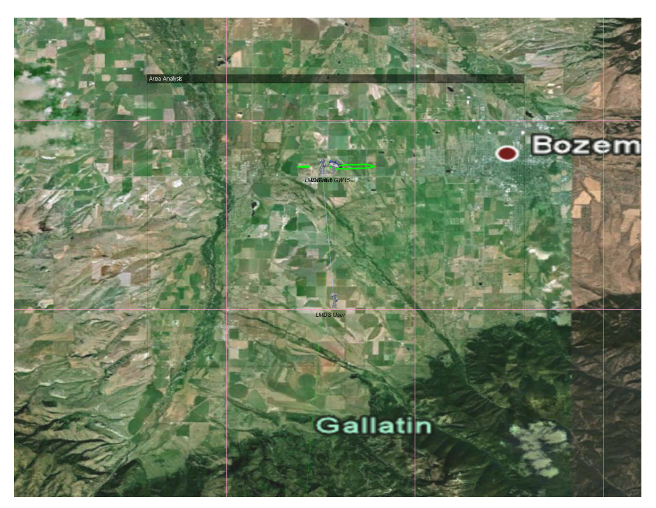
Figure 2 Visualise Scenario 2a

Figure 2 depicts Visualise scenario 2a, where the LMDS hub is 0.5 km due West of the ViaSat gateway. In this scenario, the worst case required separation is 1.6 km, but the affected area where the 6% \Delta T/T threshold is exceeded is reduced considerably from Scenario 1 to a narrow sliver to the east of the gateway earth station.