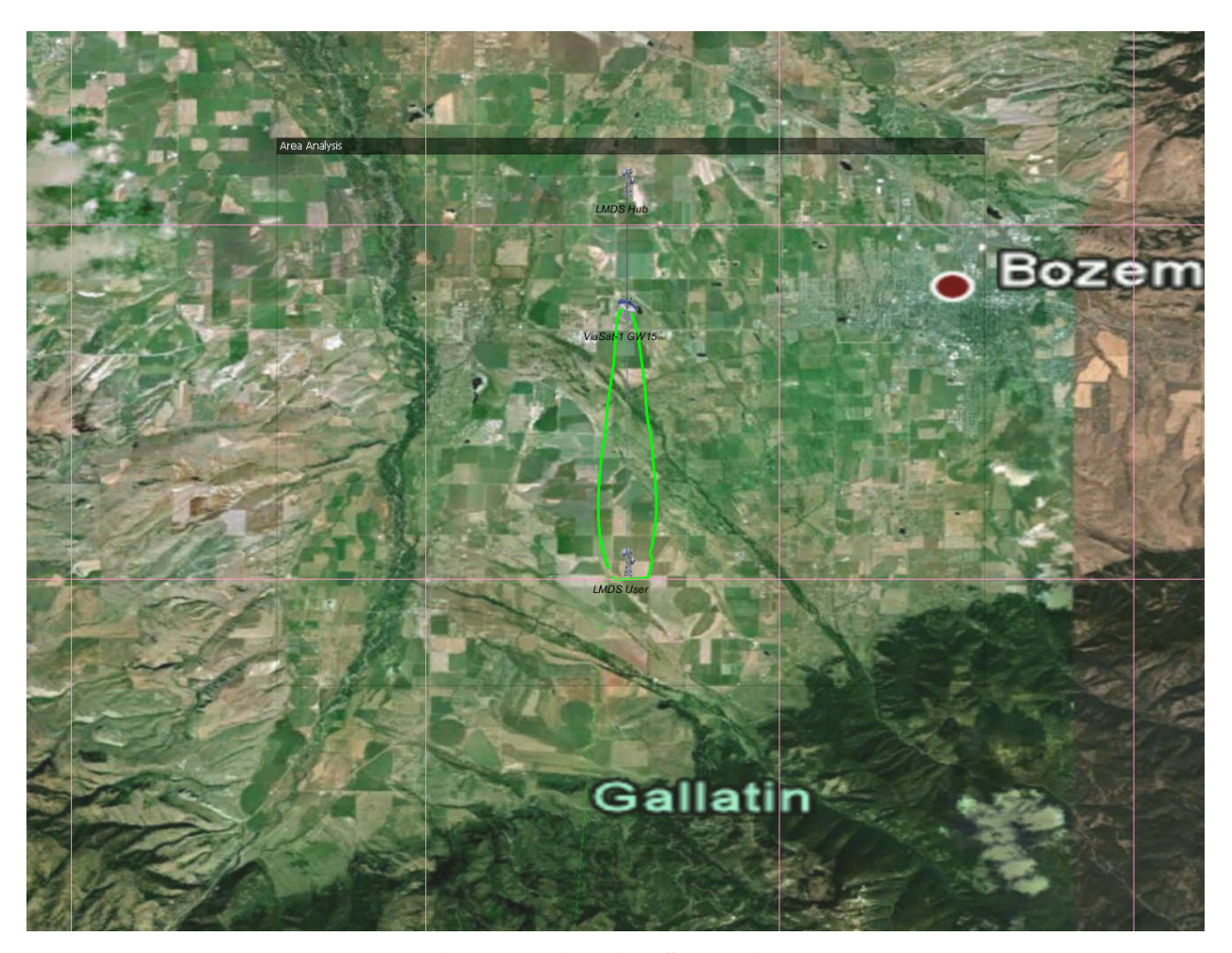
Figure 3 Visualise Scenario 2b

In figure 3, Visualise scenario 2b, the LMDS hub is located 4 km north of the ViaSat gateway and the area where the 6\% \Delta T/T threshold is exceeded is constrained to a narrow corridor that extends 8.3 km south of the ViaSat gateway.