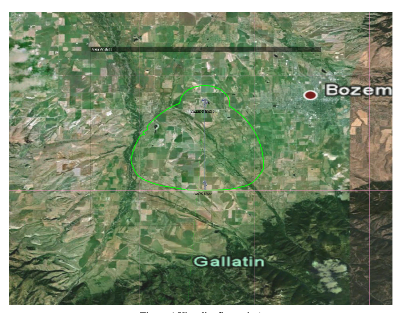
Figure 1 Visualise Scenario 1

Figure 1 depicts Visualise scenario 1, where the LMDS hub is co-sited with the ViaSat gateway and the LMDS user terminal always points towards the ViaSat gateway antenna. Under this scenario, the results show that the worst case required separation distance is 8.4 km.