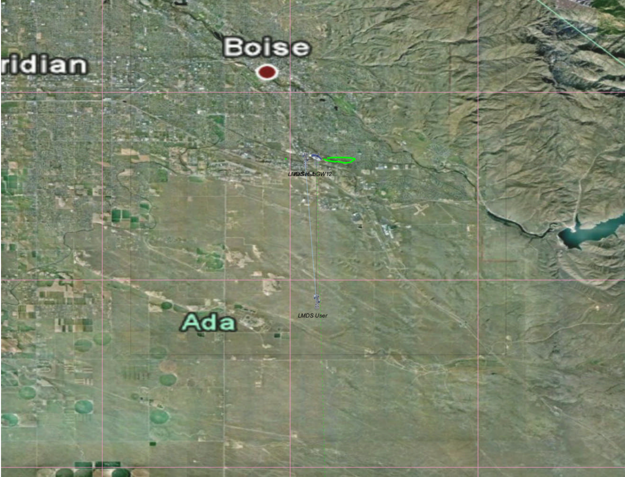
Figure 2 Visualise Scenario 2a

Figure 2 depicts Visualise scenario 2a, where the LMDS hub is 0.5 km due West of the ViaSat gateway. In this scenario, the worst case required separation is 1.6 km, but the affected area where the 6% \Delta T/T threshold is exceeded is reduced considerably from Scenario 1 to a narrow sliver to the east of the gateway earth station.