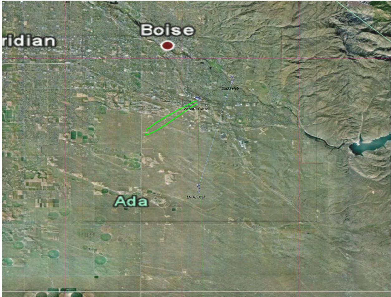
Figure 5 Visualise Scenario 2d

In figure 5, Visualise scenario 2d, the LMDS hub is located 3 km northeast of the ViaSat gateway. In this case, the area where the 6% \Delta T/T threshold is exceeded consists of a narrow sliver extending to the southwest for 4.9 km.