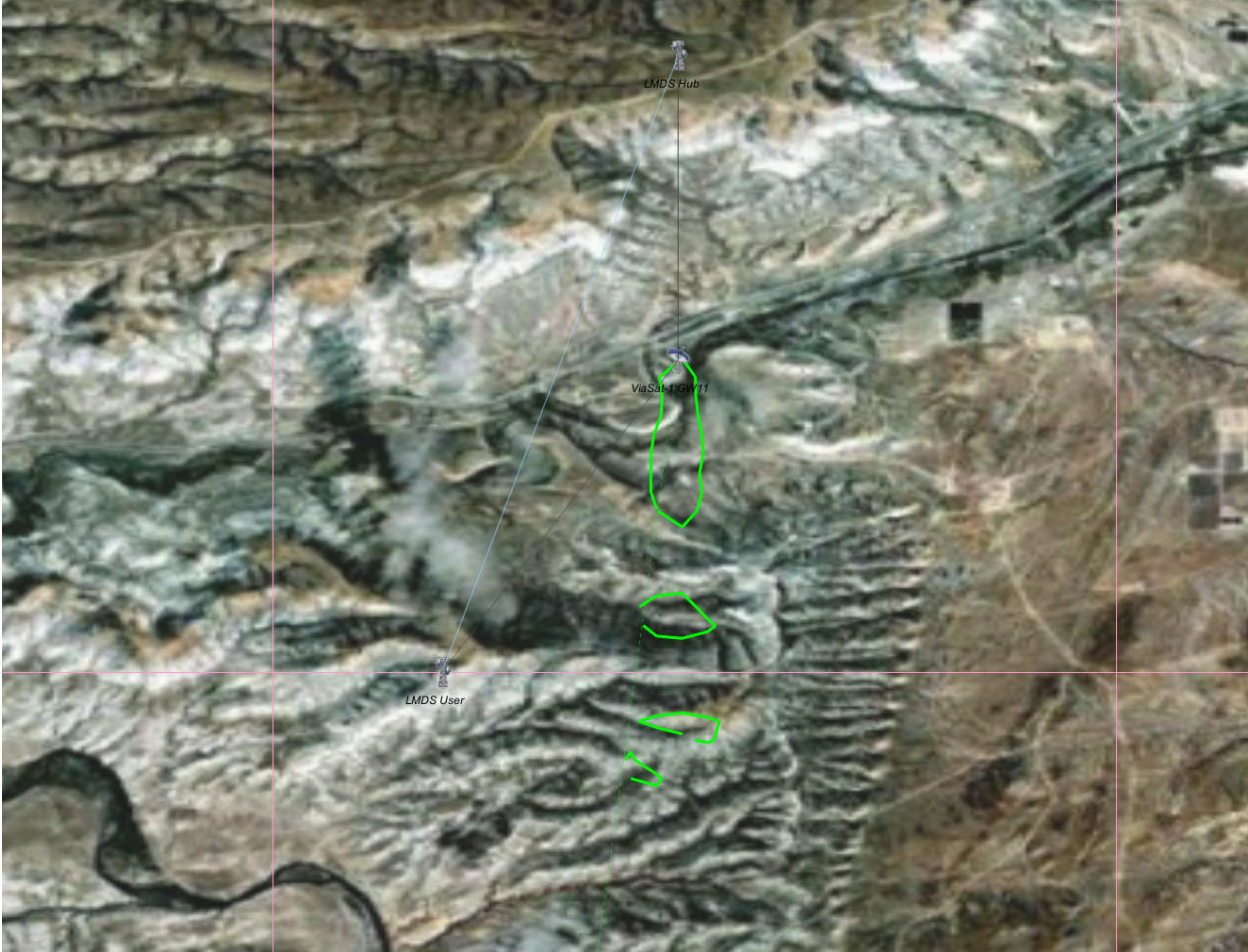
Figure 3 Visualise Scenario 2b

In figure 3, Visualise scenario 2b, the LMDS hub is located 4 km north of the ViaSat gateway and the area where the 6% \Delta T/T threshold is exceeded is constrained to a narrow corridor that extends 5.5 km south of the ViaSat gateway.