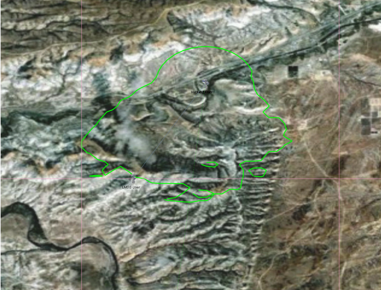
Figure 1 Visualise Scenario 1

Figure 1 depicts Visualise scenario 1, where the LMDS hub is co-sited with the ViaSat gateway and the LMDS user terminal always points towards the ViaSat gateway antenna. Under this scenario, the results show that the worst case required separation distance is 5.5 km.