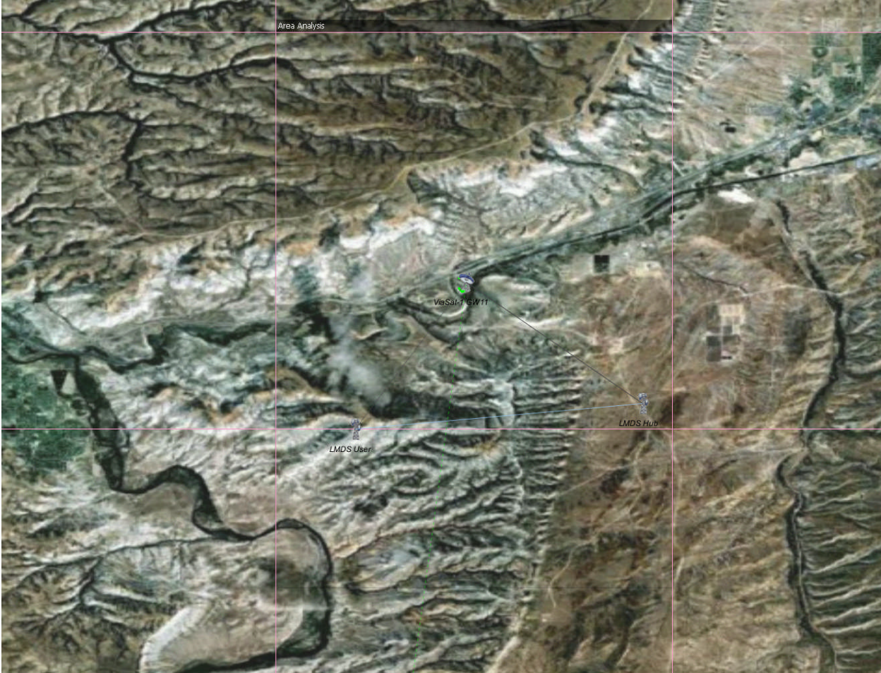
Figure 4 Visualise Scenario 2c

In figure 4, Visualise scenario 2c, the LMDS hub is located 5 km south east of the ViaSat gateway. In this case, the area where the 6% \Delta T/T threshold is exceeded is virtually nonexistent.