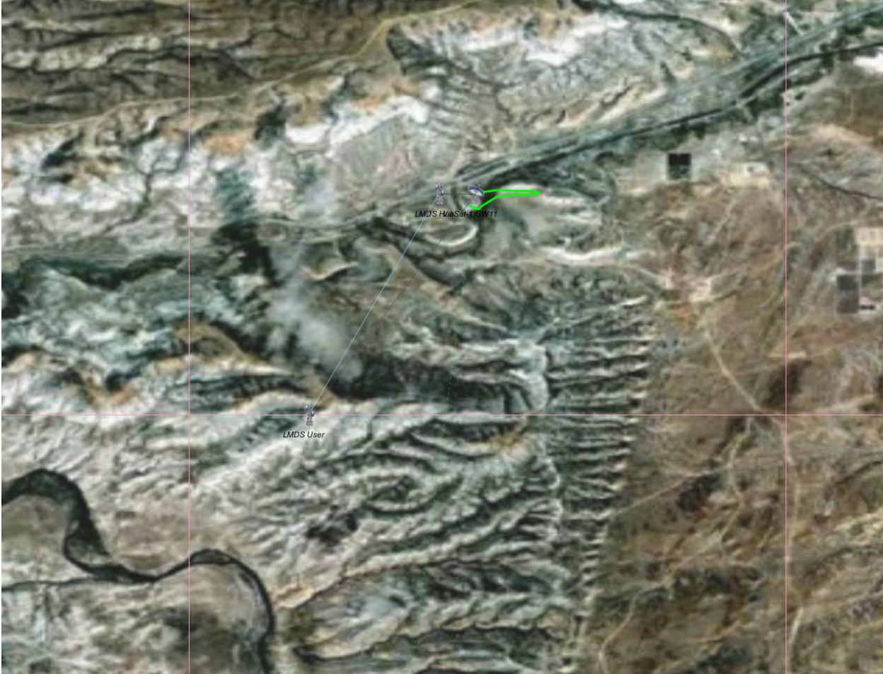
Figure 2 Visualise Scenario 2a

Figure 2 depicts Visualise scenario 2a, where the LMDS hub is 0.5 km due West of the ViaSat gateway. In this scenario, the worst case required separation is 0.9 km, but the affected area where the 6% \Delta T/T threshold is exceeded is reduced considerably from Scenario 1 to a narrow sliver to the east of the gateway earth station.