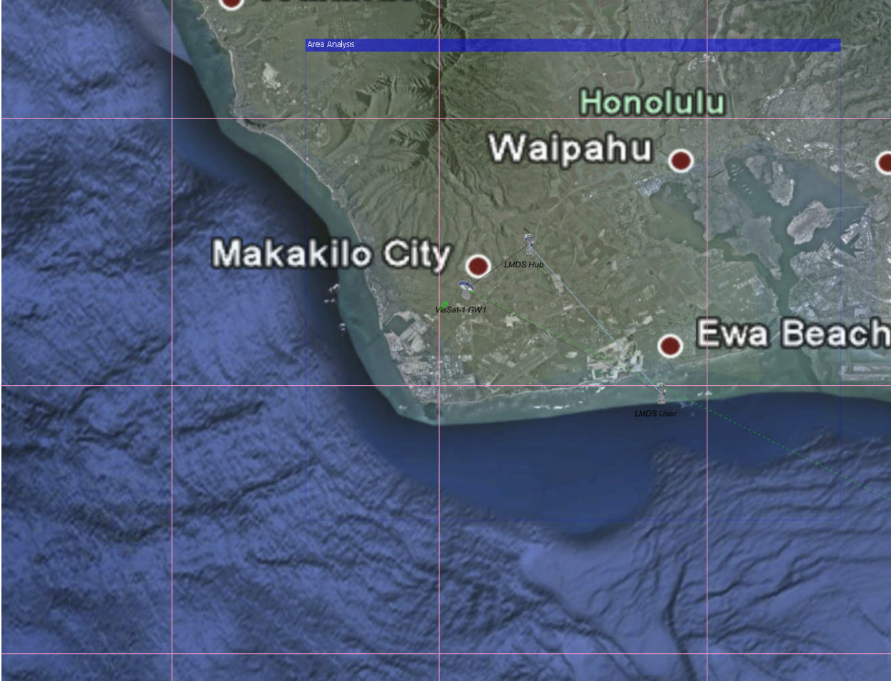
Figure 5 Visualise Scenario 2d

In figure 5, Visualise scenario 2d, the LMDS hub is located 3 km northeast of the ViaSat gateway. In this case, the area where the 6% \Delta T/T threshold is exceeded consists of a very narrow sliver extending to the southwest for less than 1 km.