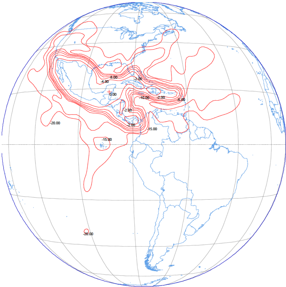
Figure B-2. DIRECTV KU-76W Ku-Band Transmit Beam