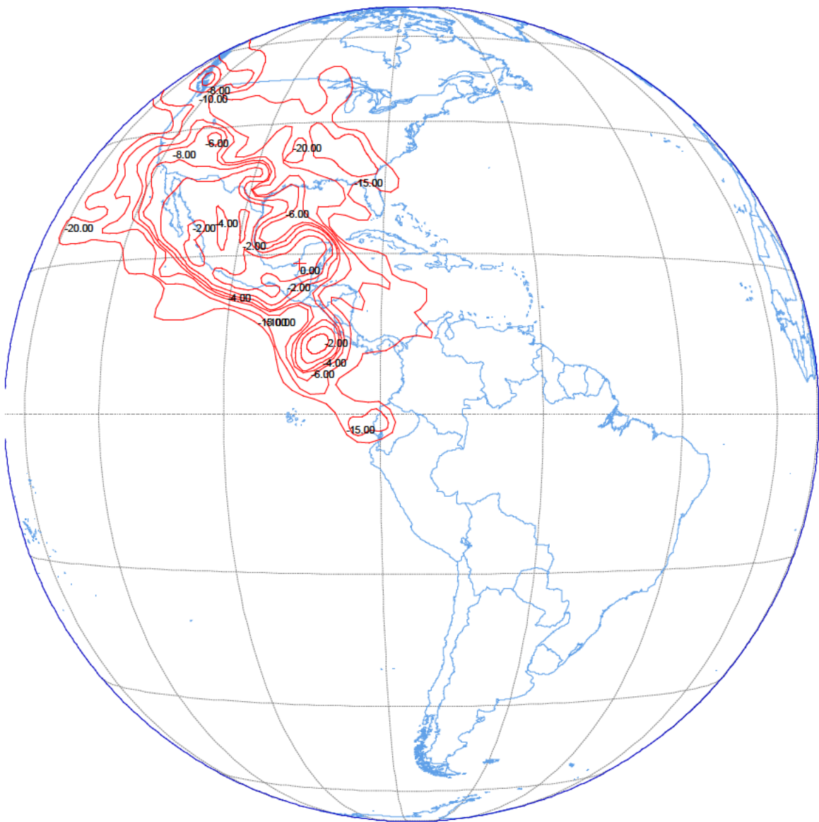
Figure B-4. DIRECTV KU-76W 17/24 GHz BSS Transmit Beam