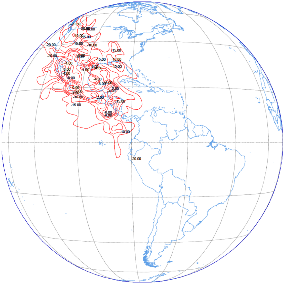
Figure B-3. DIRECTV KU-76W 17/24 GHz BSS Receive Beam