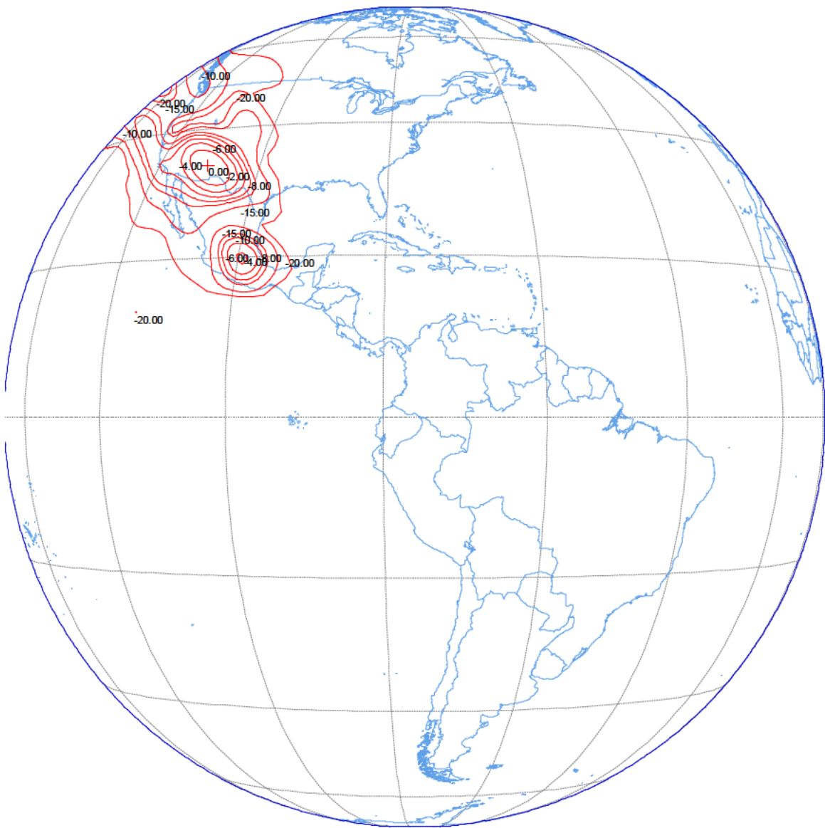
Figure B-1. DIRECTV KU-76W Ku-Band Receive Beam