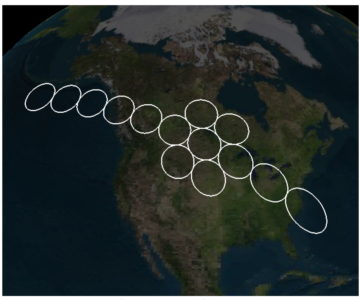
Illustration 1: , Principle axis of hexpack beam array from West North America Active Arc endof-arc