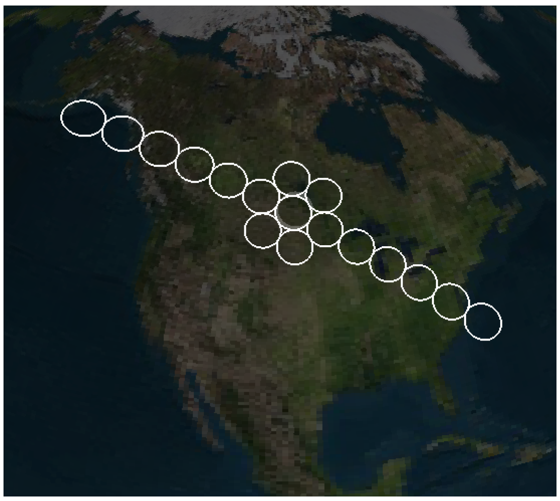
Illustration 2: Principle axis of hexpack beam array from West North America Active Arc apogee