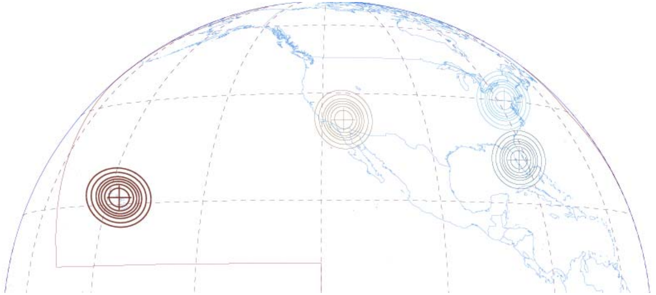
Figure 2-3. Spot Beams (28, 31, 48, 50) Antenna Gain Contours (Contours shown -2dB,-4dB,-6dB,-8dB,-10dB and -20dB)

All downlink beams will have a gain of 46.5 dB (including antenna losses) and a minimum cross-polarization isolation of 30 dB, and have essentially identical contours as shown in Figure 2-2.