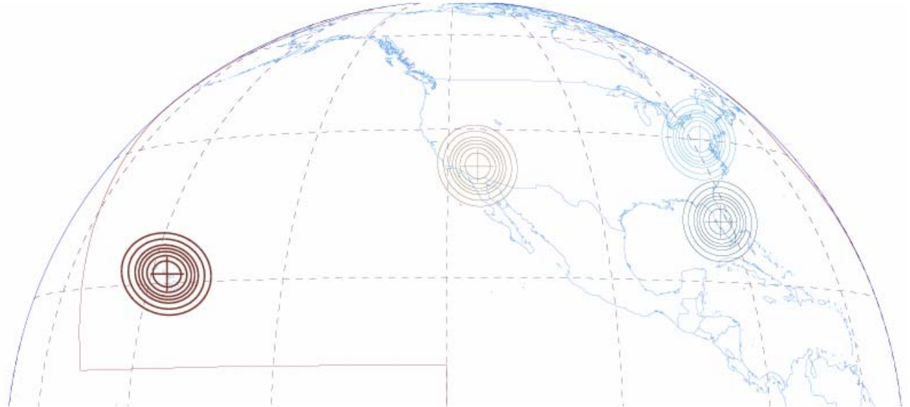
Figure 2-3. Spot Beams (28, 31, 48, 50) Antenna Gain Contours (Contours shown -2dB,-4dB,-6dB,-8dB,-10dB and -20dB)

All downlink beams will have a gain of 46.5 dB (including antenna losses) and a minimum cross-polarization isolation of 30 dB, and have essentially identical contours as shown in Figure 2-2.