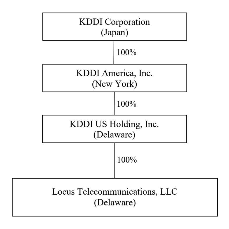
\label{eq:exhibit} \textbf{Exhibit A} Overview of the Pre-Transaction Ownership Structure