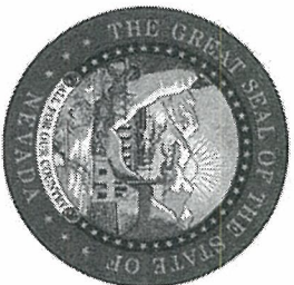
ROSS MILLER Secretary of State

Electronic Certificate Certificate Number: C20080828-0511 You may verify this electronic certificate online at http://www.nvsos.gov/