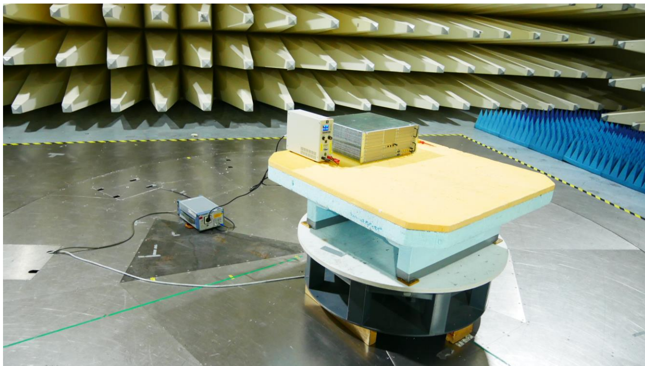
Test setup for AC powerline conducted emissions