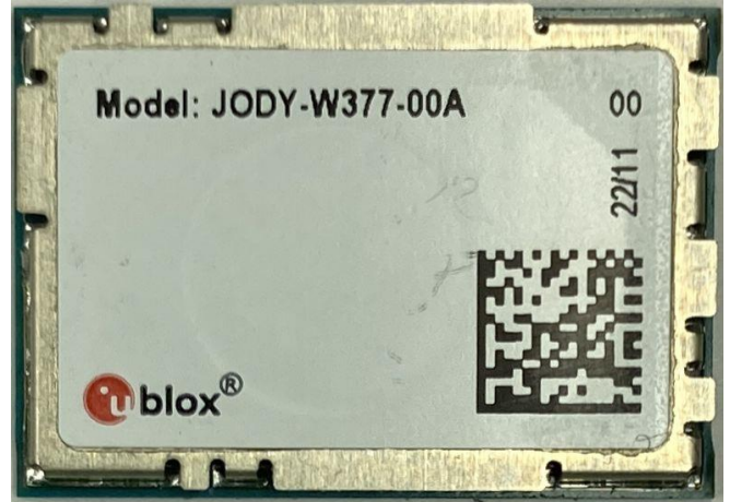
Figure 5: JODY-W377-00A top view external photo