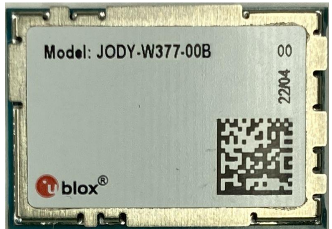
Figure 7: JODY-W377-00B top view external photo