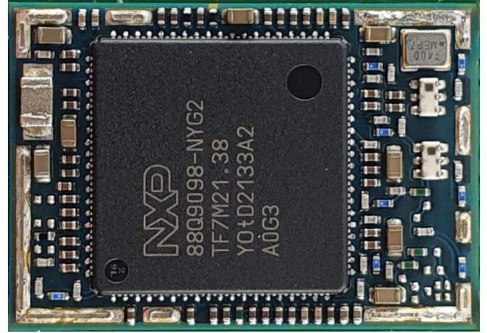
Figure 2: JODY-W377-00A and JODY-W377-00B internal photo