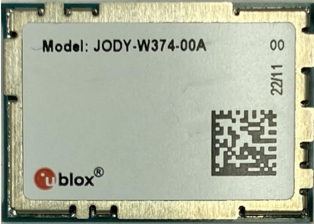
Figure 4: JODY-W374-00A top view external photo