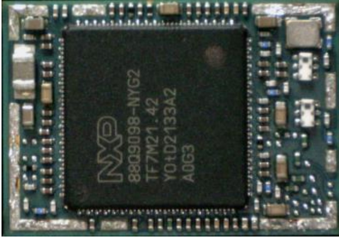
Figure 1: JODY-W374-00A and JODY-W374-00B internal photo