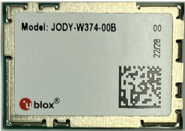
Figure 6: JODY-W374-00B top view external photo