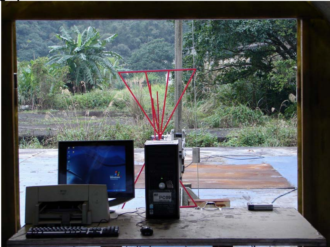
Front View of The Test Configuration (PC charge)