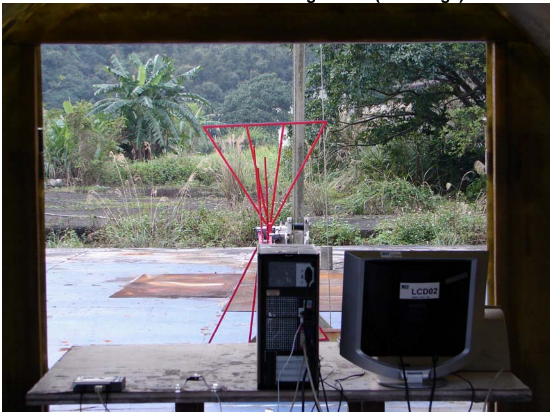
Rear View of The Test Configuration (PC charge)