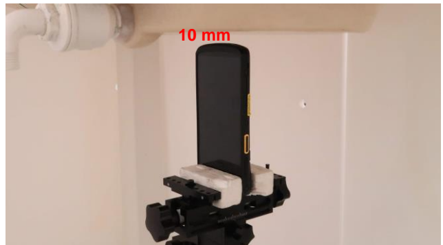
Bottom Side at 10 mm