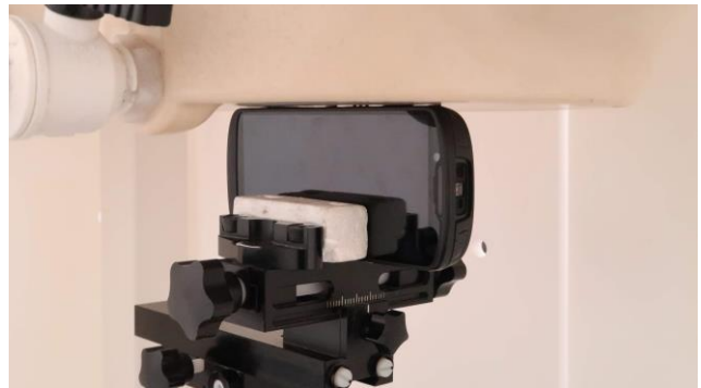
Left Side at 0 mm