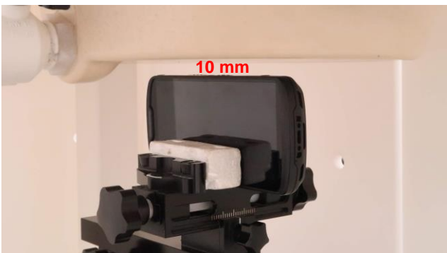
Right Side at 10 mm