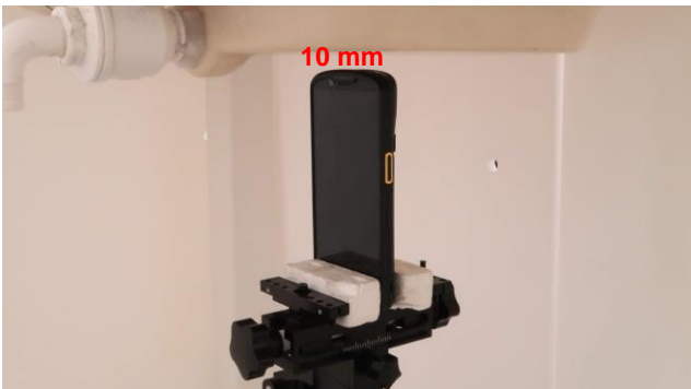
Top Side at 10 mm