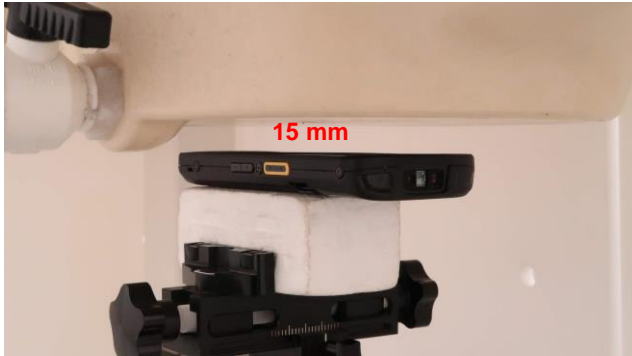
Front at 15 mm