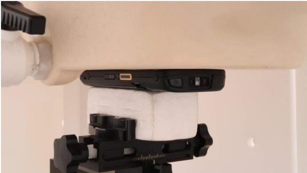
Front at 0 mm