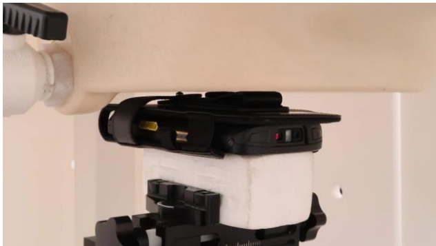
Back with Soft Holster at 0 mm