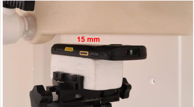
Back at 15 mm