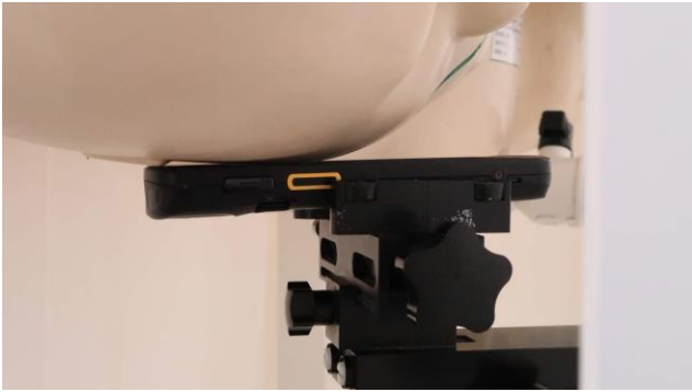
Right Cheek at 0mm