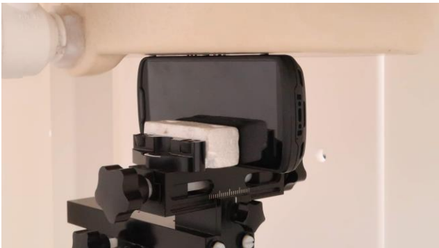
Right Side at 0 mm