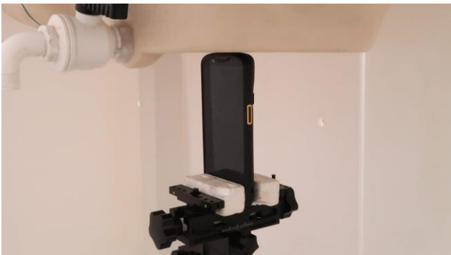
Top Side at 0 mm