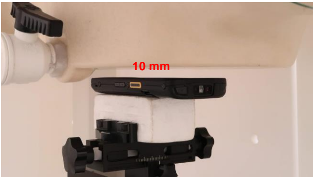
Front at 10 mm