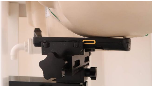
Left Cheek at 0mm