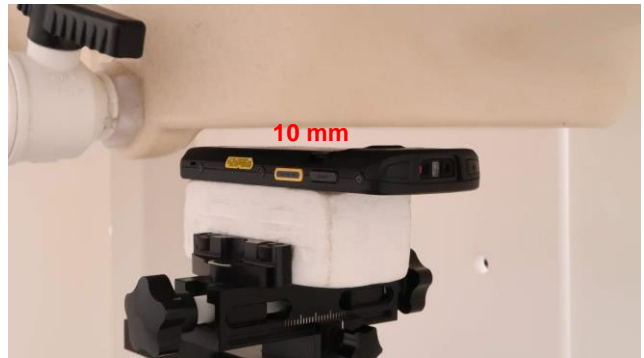
Back at 10 mm