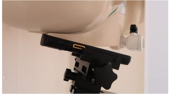
Right Tilted at 0mm