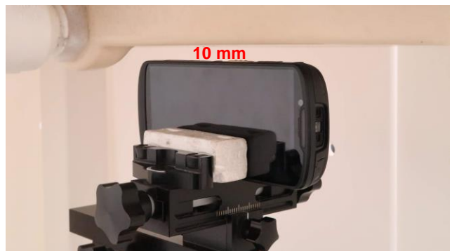
Left Side at 10 mm