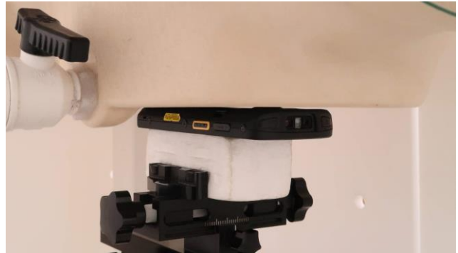
Back at 0 mm