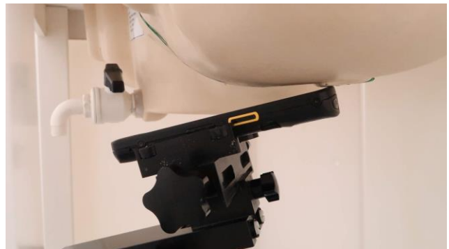
Left Tilted at 0mm