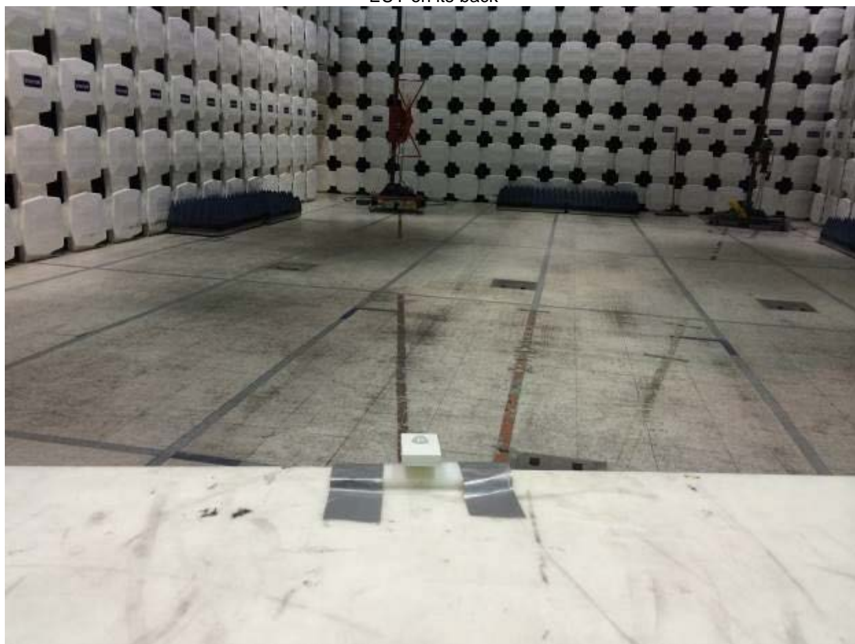
Setup Photographs: EUT on its back