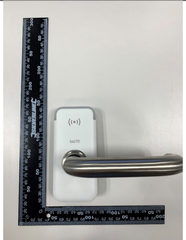
Photo 4: Part of the lock located on the outside of the door. All the electronic is contained in this part.