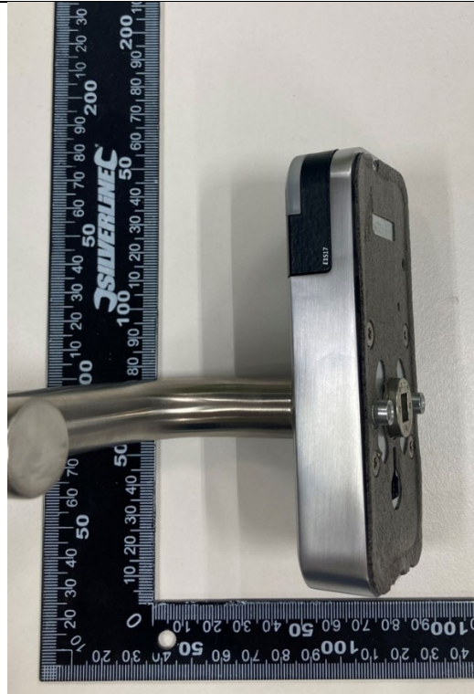
Photo 6: Side view of the part of the lock located on the outside of the door. CE type reference.