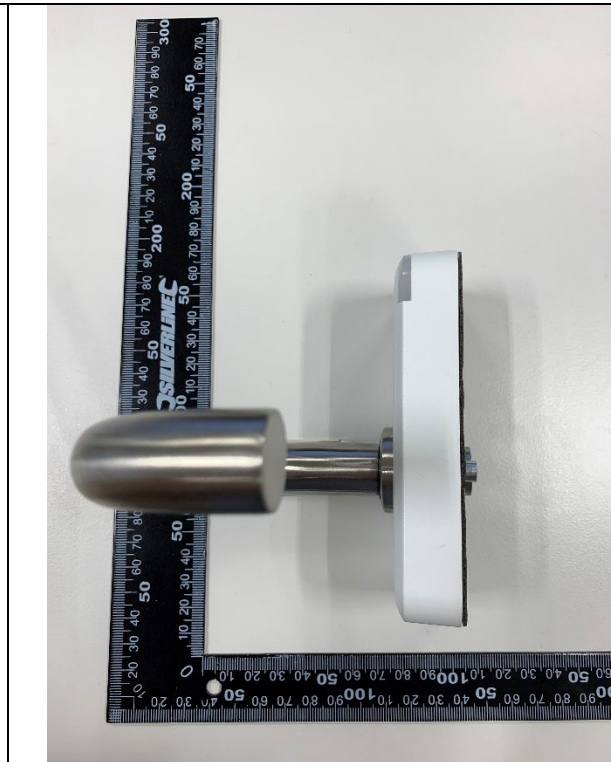
Photo 6: Side view of the part of the lock located on the outside of the door.