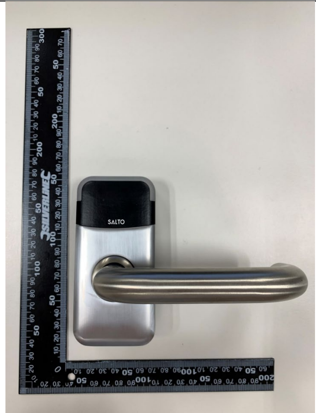
Photo 4: Part of the lock located on the outside of the door. All the electronic is contained in this part.