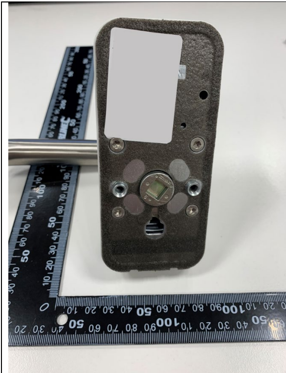
Photo 5: Back of the part of the lock located on the outside of the door.