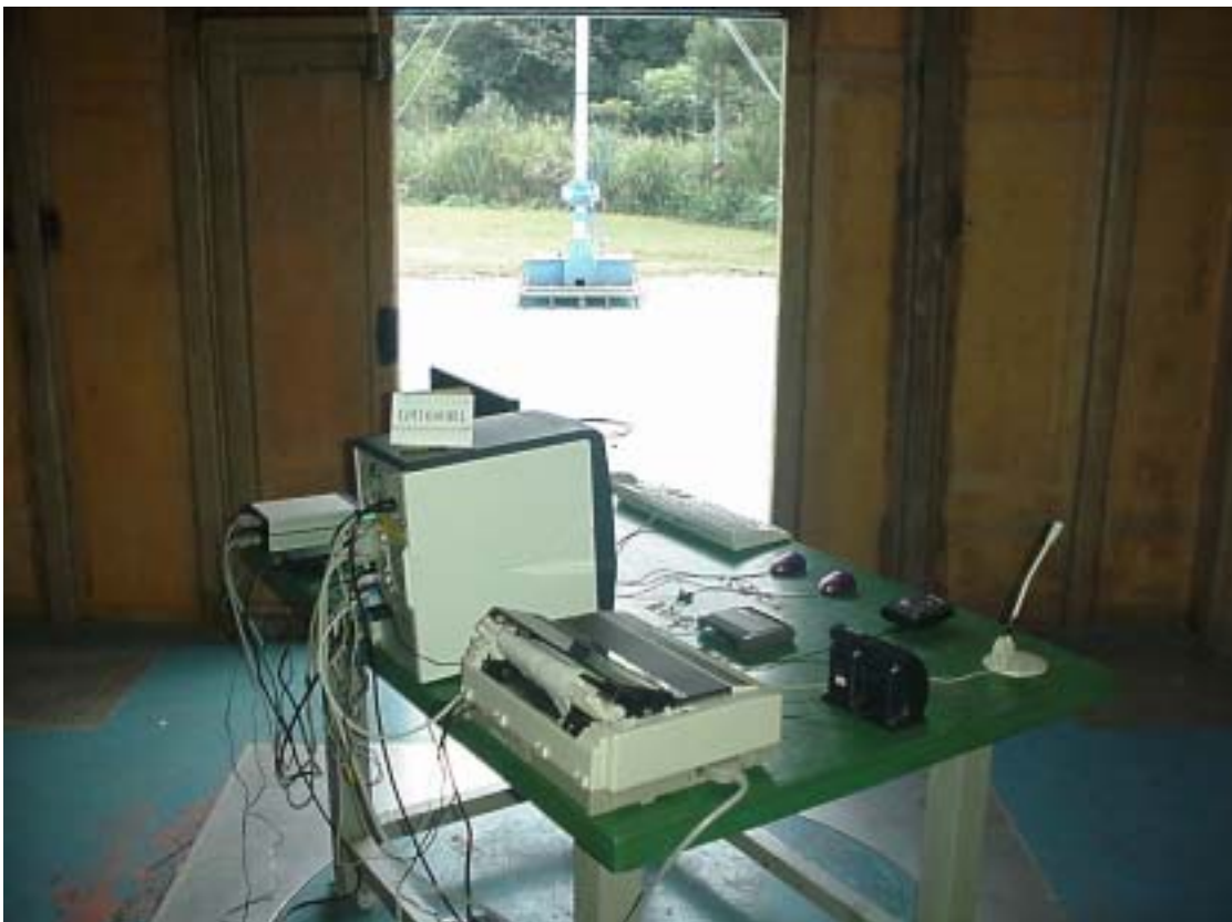
SETUP WITH MAXIMUM DETECTED EMISSION AT VERTICAL POLARIZATION