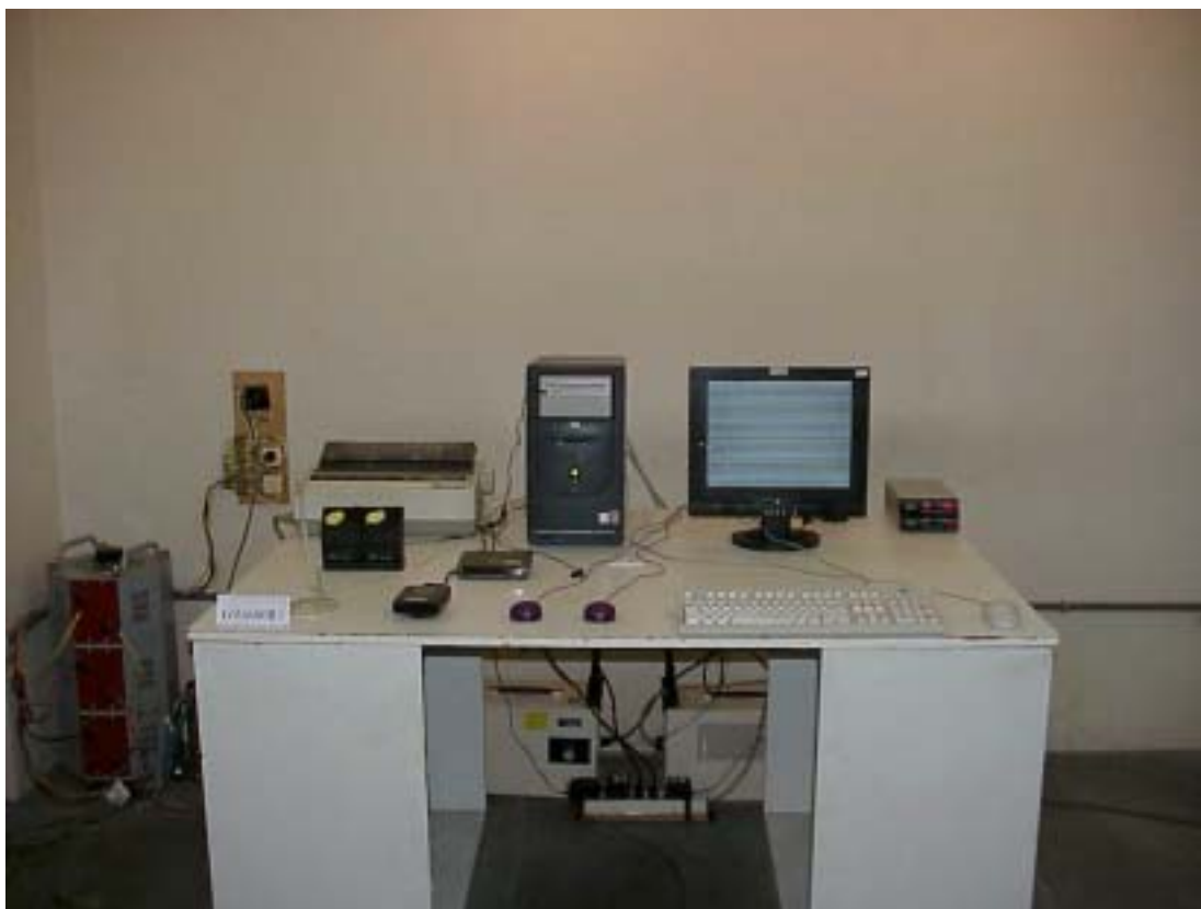
FRONT VIEW OF CONDUCTED TEST