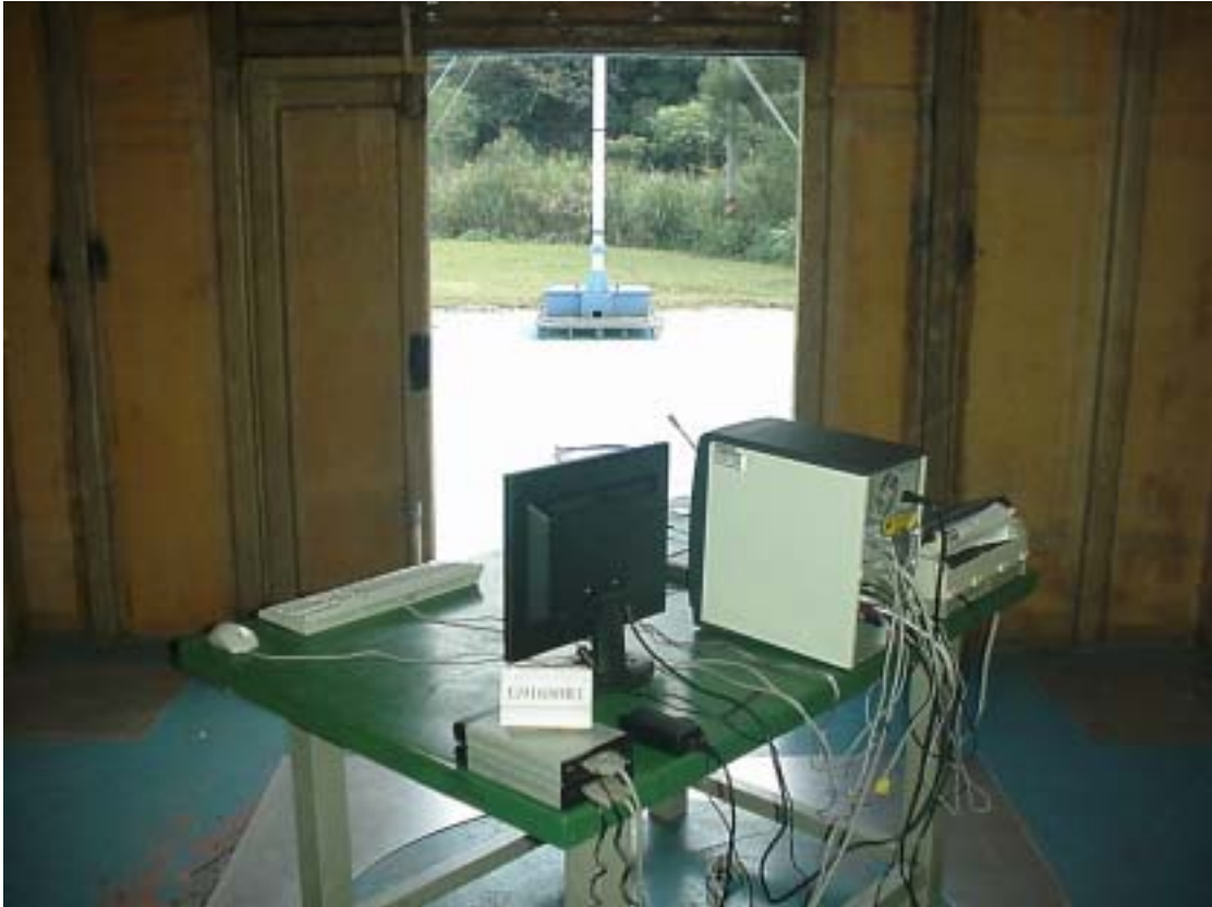
SETUP WITH MAXIMUM DETECTED EMISSION AT HORIZONTAL POLARIZATION