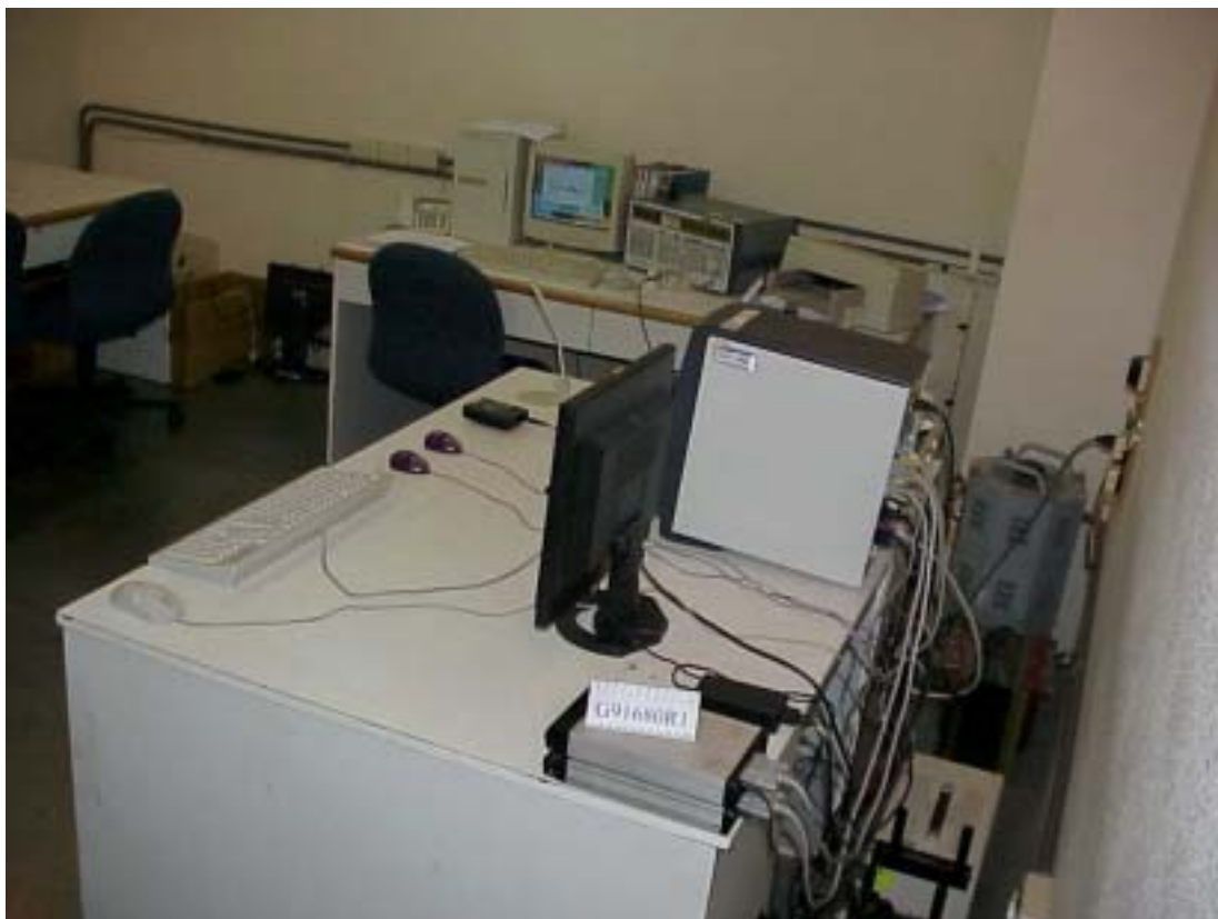
BACK VIEW OF CONDUCTED TEST